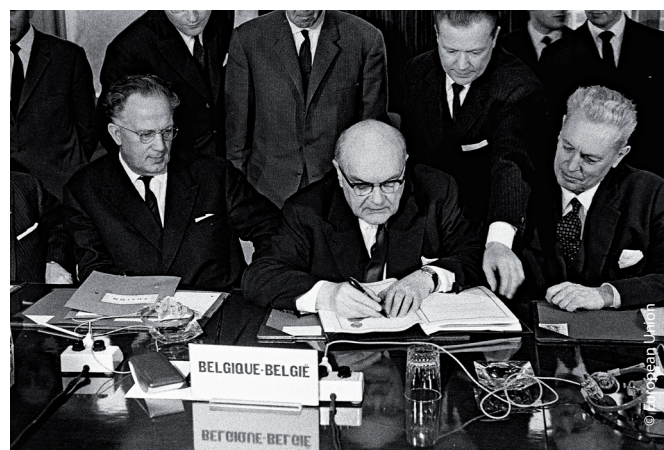
Spaak signing a European treaty on behalf of Belgium in 1965.

Throughout his political life, Spaak always defended the importance of European integration and the independence of the European Commission with great vigour: "The Europe of tomorrow must be a supranational Europe," he stated to rebuff French President de Gaulle's 1962 'Fouchet Plan', attempting to block both the British entry to the European Communities and undermine their supranational foundation. The European unity Spaak envisaged was mostly economic. The Belgian statesman desired political unification but not on the basis of the Common Market countries alone. He was therefore against any further actions until economic integration of Britain into the union had taken place. He retired from politics in 1966 and died in Brussels in 1972.