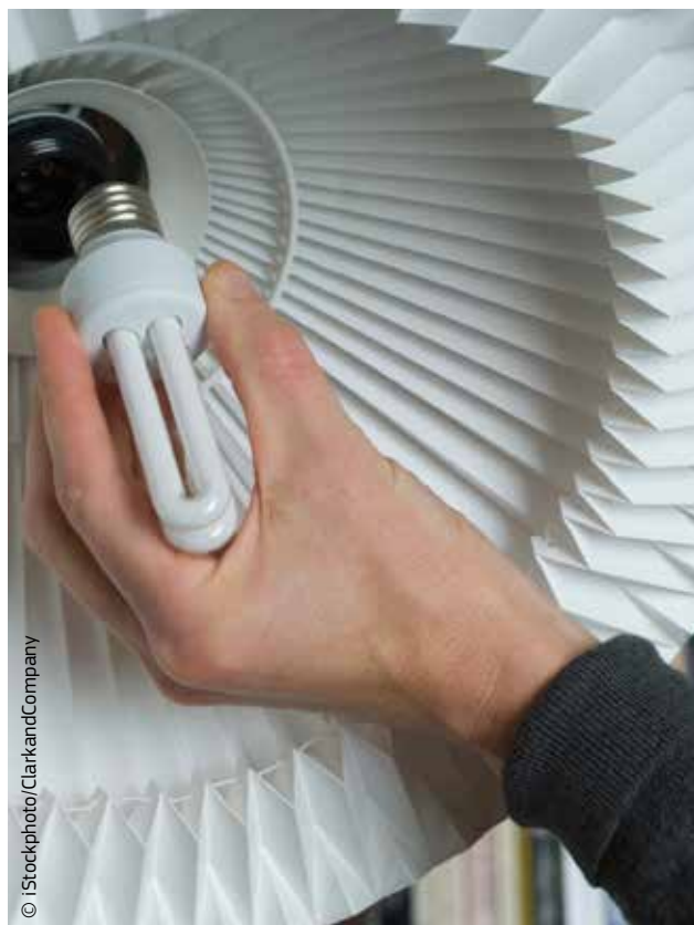
Even changing to energy-efficient light bulbs can make a difference.

Developing countries, particularly the poorest and most vulnerable, require significant financial help to reduce their greenhouse gas emissions and adapt to the consequences of climate change.