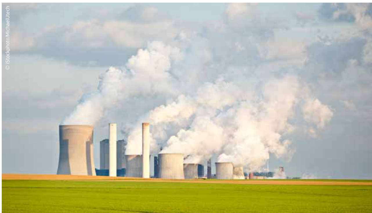
The EU ETS is a key tool in the cost-effective reduction of greenhouse gases.

These discussions involve political leaders at the highest levels. At the leaders' summit on climate change hosted by UN Secretary-General Ban Ki-moon in September 2014, some 120 world leaders expressed their willingness to commit to the urgently needed global efforts. Businesses and wider civil society participated in great numbers, and the so-called People's Climate March saw some 500 000 people take to the streets of New York.