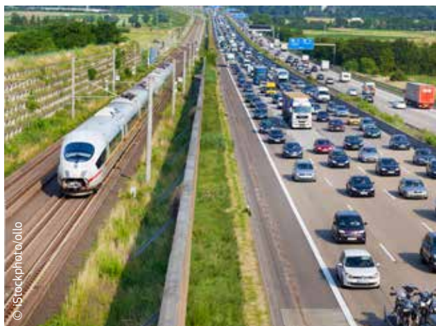
Transport is one of the major sources of greenhouse gas emissions.

Cars and vans produce some 15 % of the EU's emissions of CO 2 , so reducing these can make a significant contribution to combating climate change.