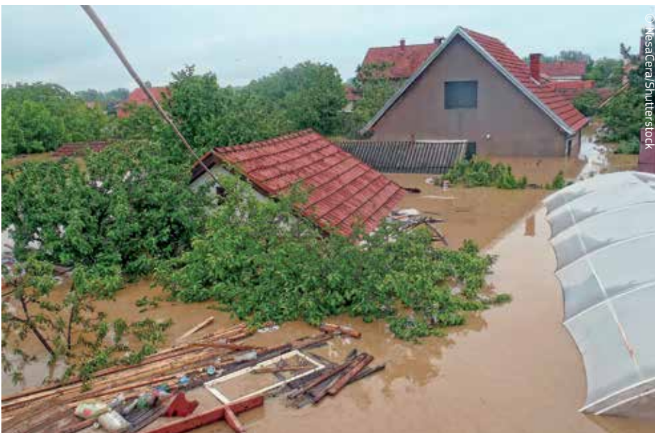
The EU Solidarity Fund provides financial aid to any EU region affected by major natural disasters.

Another important fund managed by the European Commission is the EU Solidarity Fund (EUSF), initially set up in summer 2002 as a response to severe flooding in central Europe. The EUSF is now a stable fund with a yearly budget of €500 million. It is an expression of solidarity with disaster-stricken regions in Europe. It enables the EU to respond in a rapid, efficient and flexible manner to assist any EU country (or country applying for membership) in the event of a major natural disaster with serious repercussions on living conditions, the environment or the economy. The EUSF complements national public service efforts by contributing, for instance, to clean-up operations, restoring infrastructure or providing temporary accommodation.