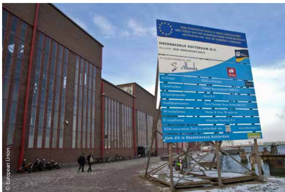
Campus of the RDM Innovation Dock, a project supported by EU regional policy funds. This former shipyard in Rotterdam, the Netherlands, was turned into a campus for educational institutions, innovative business and research institutes in 2011.