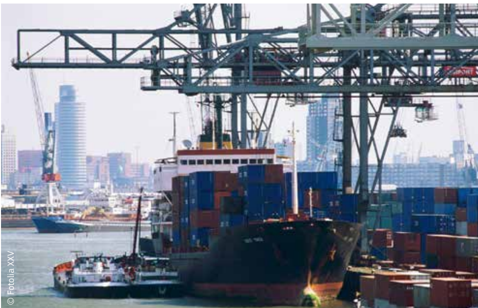
The European Union is one of the largest traders with a share of the global market equivalent to the US and larger than China.

The EU is continuing to establish bilateral free trade agreements with major partners, possibly expanding them to cover the greater part of EU trade. However, as global trade continues to rise, customs duties will no doubt continue to make a significant contribution to the EU budget.