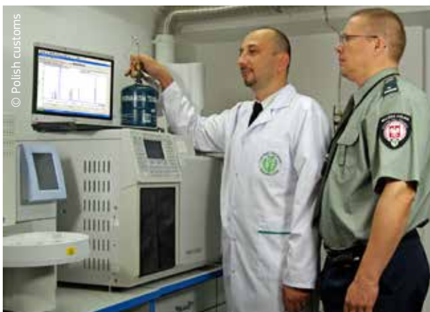
Ensuring the safety and security of citizens is increasingly a high-tech business.

The basis for managing the customs union is the Union Customs Code (formerly the Community Customs Code), which is agreed by the European Parliament and the Council of the European Union. As new processes are implemented and new challenges arise, the Commission and national customs authorities work together to revise the various implementing procedures of the code.