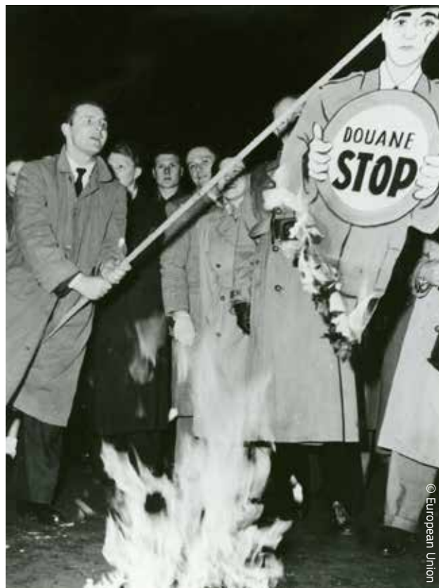
Members of the Belgian section of the European Movement demonstrated against border controls in Liège in 1953.

Germany, France and Italy had joined the Benelux countries in founding the European Coal and Steel Community in 1951. Its president, the former Belgian prime minister Paul Henri Spaak, began work on the idea of a broader customs union in 1955. His report formed a significant part of the basis for the 1957 Treaty of Rome that established the European Community and provided for a customs union between all its members by the end of the next decade.