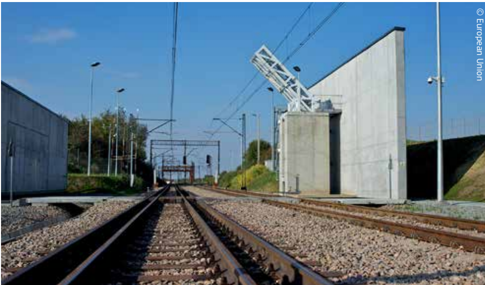
Checking wagons on railways: a train scanner at the border between Ukraine and Poland.