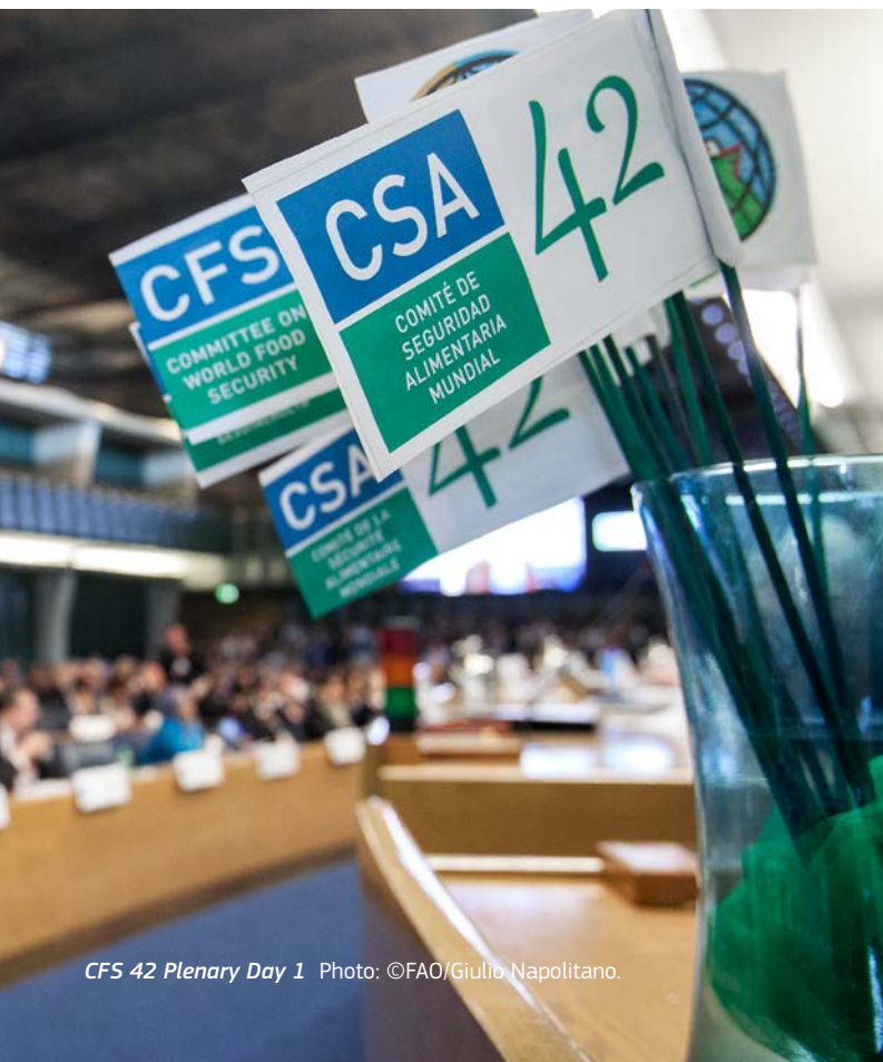
CFS 42 Plenary Day 1