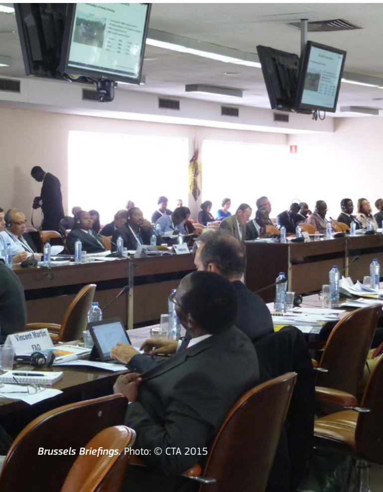
Brussels Briefings.