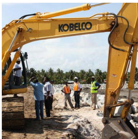
Climate change adaptation in Guyana.