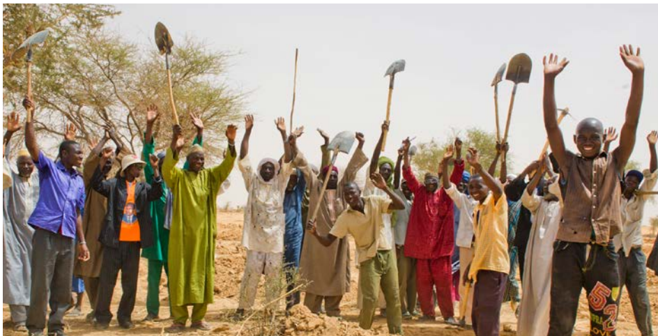
Pastoralists in Niger.

The online network on food and nutrition security, sustainable agriculture and rural development