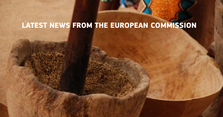
Grinding millet, Mali.