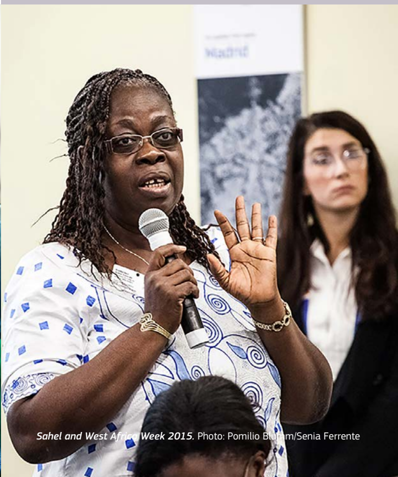
Sahel and West Africa Week 2015.