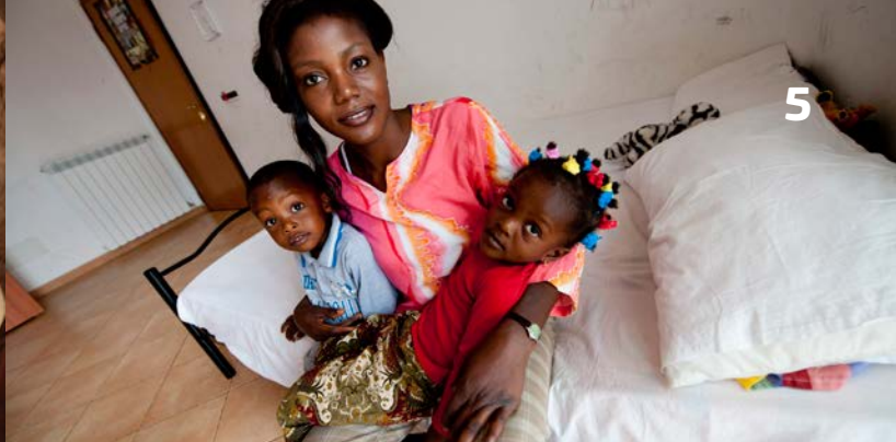
Nigerian woman and her children at the Dublino Centre.