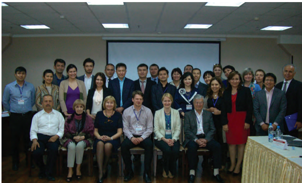
Horizon 2020 Info Day in Tashkent on 17 April 2015

On 17 April 2015 an Information Day on Horizon 2020, the EU Framework Programme for Research and Innovation, was held at the 'Miran International' hotel in the frame of the IncoNet CA project.