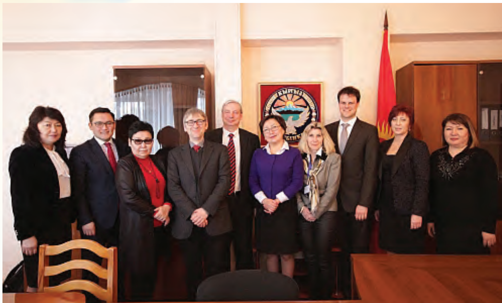
Hosts and experts at the White House in Bishkek

The team of international experts conducting the mission to Kyrgyzstan consisted of: