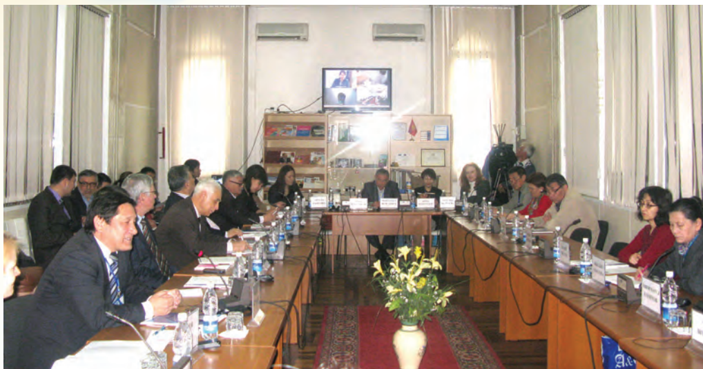
Horizon 2020 Info Day in Bishkek on 15 April 2015

On 15 April 2015 the National Coordinating Center of Horizon 2020 in the Kyrgyz Republic held an Informational Seminar on the European Union's Framework Programme for Science and Innovation 'Horizon 2020'. The main objective of the seminar was to strengthen the involvement of the scientific community of Kyrgyzstan in 'Horizon 2020' research projects.