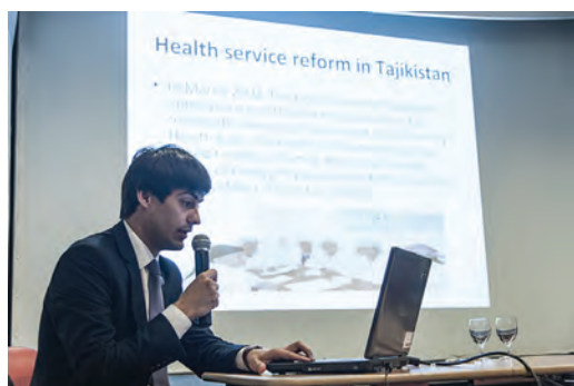
Health Workshop