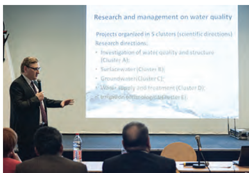
Climate Change Workshop

The main objective of these events was to inform EU researchers about the research landscape in Eastern Partnership and Central Asian countries, to build inter-regional networks, and last but not least to build up new contacts and potential project consortia to participate in Horizon 2020 calls. This last objective was supported by several bilateral matchmaking talks organised by Euresearch, Switzerland as a part of the three-day event. Participants of the side-events highly appreciated both the content of the STI Days and networking possibilities during the conference.