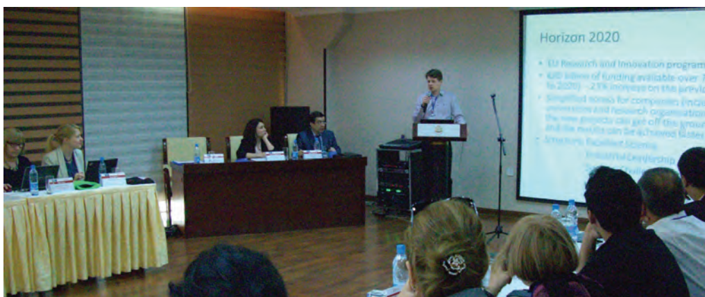
Horizon 2020 Info Day in Tashkent on 17 April 2015

'Horizon 2020', the EU Framework Programme for Research and Innovation started in January 2014. This Framework Programme is a huge initiative for financing scientific research and development, which combines the current Framework Programmes for scientific research and technological development, competitiveness and innovation, as well as the European Institute of Innovation and Technology (EIT).