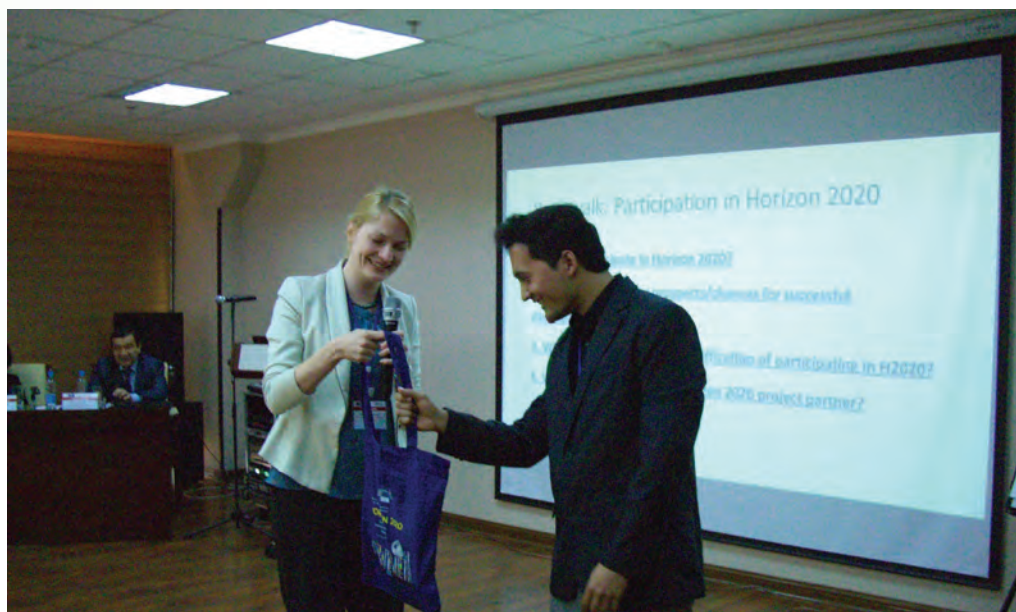
Horizon 2020 Info Day in Tashkent on 17 April 2015

The speakers also presented information on Horizon 2020, the EU Framework Programme for Research and Innovation, the Participant Portal, information on how to be involved and find partners, and twinning grants and discussed issues regarding the developing of cooperation between scientists and specialists of Uzbekistan and the EU.