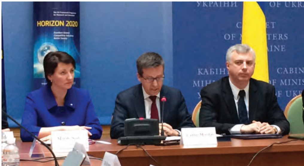
Impression from the meeting in Kyiv

Researchers, businesses and innovators from Ukraine will now be able to fully participate in Horizon 2020, the European Union's research and innovation funding programme, on equal terms with EU Member States and other associated countries. This is thanks to the Agreement for the Association of Ukraine to Horizon 2020, signed on 20 March in Kyiv by Carlos Moedas, European Commissioner for Research, Science and Innovation, and Serhiy Kvit, Minister of Education and Science of Ukraine.