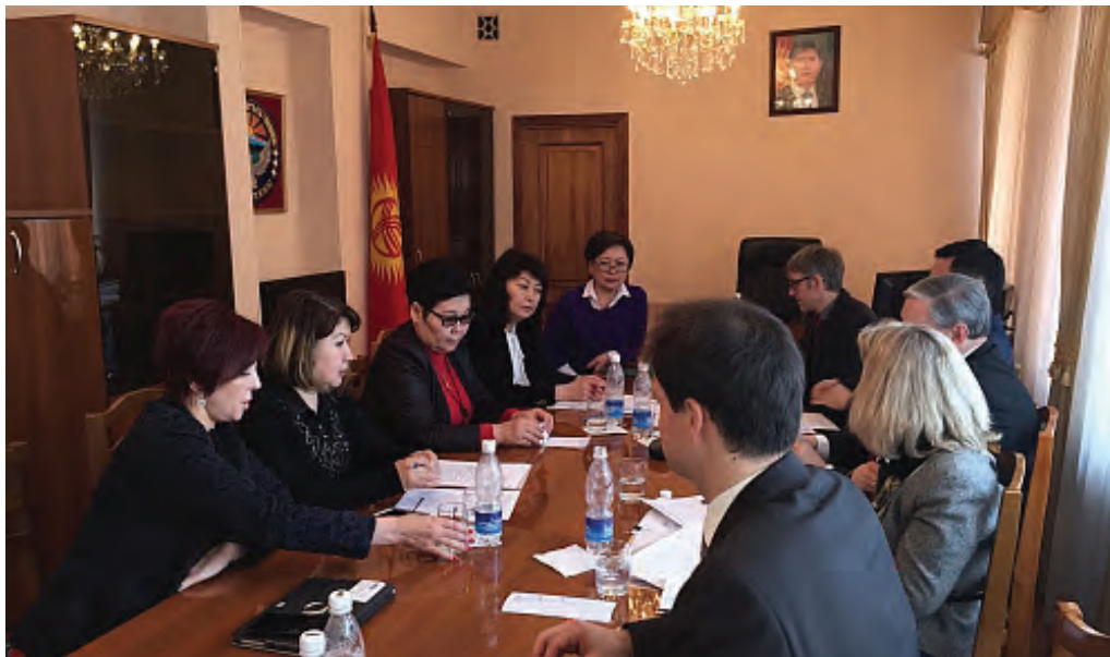
Photos on this page: work meetings during the Policy Mix Peer Review

paid to the issues of Human Resources, Economic and Market Development, the Scientific Basis and the sector of Business R&D and Innovation.