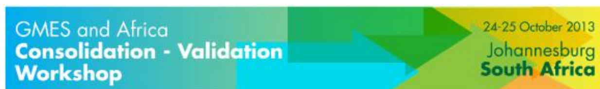
Annex 1: List of Participants of the GMES & Africa Consolidation-Validation Workshop, 24-25 October 2013, Johannesburg, South Africa.