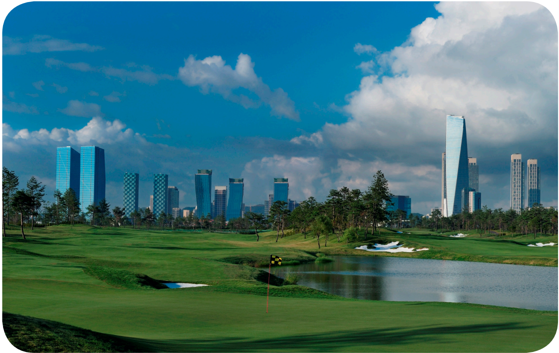
Songdo skyline viewed from the golf course

The delicate balance between maximizing energy efficiency and sustainable design versus project development costs is an area that has received much attention during design and construction of Songdo. Project funding consists of US$35 billion borrowed by Gale International from the domestic South Korean financial market, and US$100 million of Gale's own funds. More than US$10 billion has been invested thus far, and approximately 100 buildings have been completed or are currently under construction.