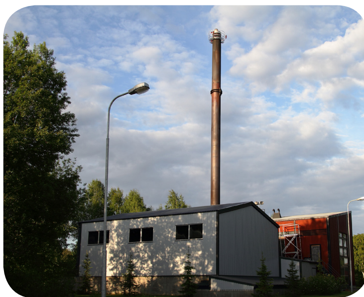
District heating in Parikkala has been converted to renewable sources, mainly wood chips

In the first phase of the project, the current GHG emissions were assessed by SYKE in order to establish baseline emissions in 2007. In addition, on-line GHG emission monitoring is now possible for each of the municipalities involved in the project. The relevant energy companies offer weekly data on the use of fossil fuels for the purpose of the calculation system. This feedback is used for