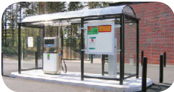
Bio-gas is now available as a vehicle fuel in Växjö

The district heating system in Växjö is unique in the way it has included old buildings. District heating systems using renewable energy exist in other cities, but old buildings are seldom connected to them due to the