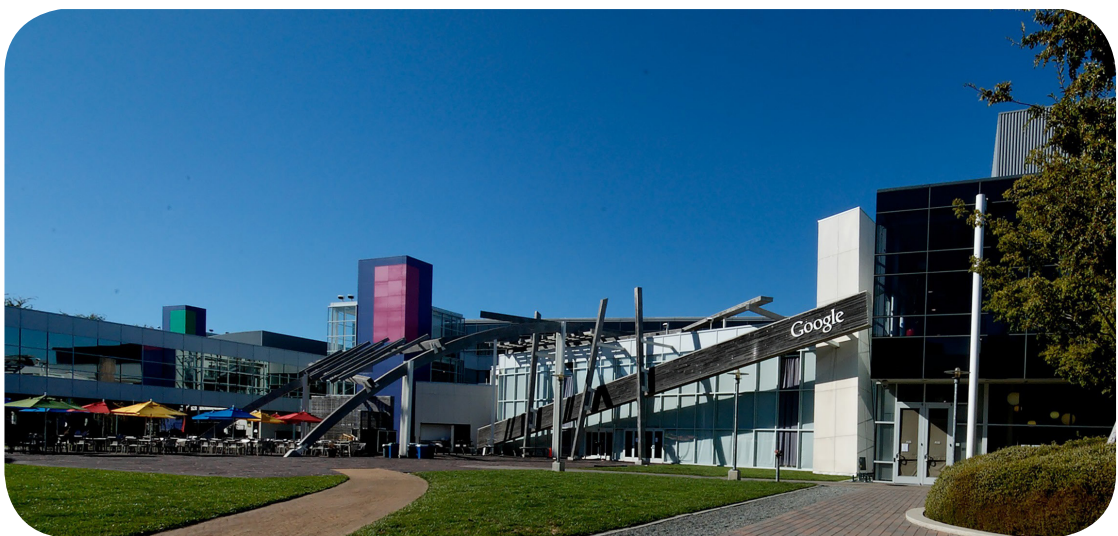
Google Complex in Silicon Valley, near San Jose

The city's entire public vehicle fleet will run on alternative fuels through the purchasing of specialised vehicles, expanding plug-in stations and alternative fuel depots, and supporting the development of energy-efficient vehicles. 100,000 new trees will be planted with the combined