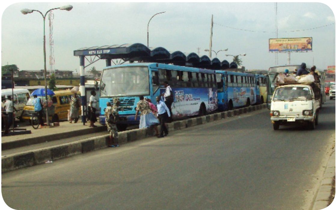
Demarcation of carriageway on Ikorodu Road

The wide acceptance of the BRT scheme has been facilitated by involving different groups of stakeholders through community engagement programs. These interactions have ensured that BRT-Lite is seen as a project created, owned and used by Lagosians. Through this approach, a sense of local ownership was developed that resulted in BRT-Lite being seen as designed for its users, rather than for bureaucrats. Third party advocacy was also employed whereby opinion leaders (local government chairmen, local chiefs and community leaders) were invited to discussions on the operation of BRT, and its benefits to the people. This group of stakeholders went on to endorse the scheme in their local communities. A public education campaign on the BRT was also carried out, including advertising along the BRT route and in print and electronic media. Brochures explaining the new system were produced in local languages and distributed to the general public at road-shows.