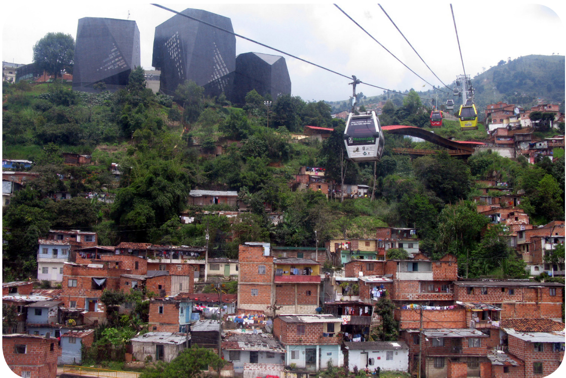
Metrocable Line K with the Parque España library in the background

The first line was made possible through the combined technical foresight of the city's publicly owned Metro de Medellín (Medellín Metro Company) and the political will of a newly elected mayor. It arose from the desire to promote social development in a deprived area, and increase passenger numbers for an underutilised overground mass-transit metro system.