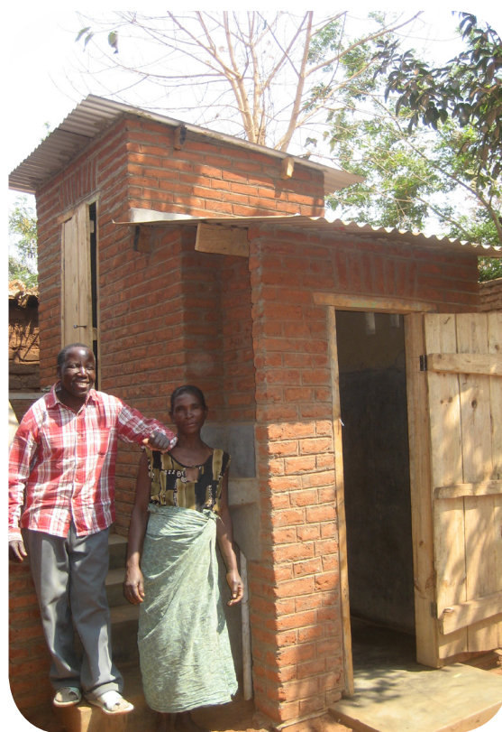
Ecosan adopters in Mtandire, Lilongwe. Ecosan adopters are predominantly landlords who invest in the facility for their own use as well as for use by their tenants.

To amplify the natural trajectory of demand, MHPF members who were the first adopters of the ecosan organised into mobilisation task teams. The mobilisation task teams function to create awareness around the space saving, food security and health benefits of ecosan. Once demand has been catalysed, households