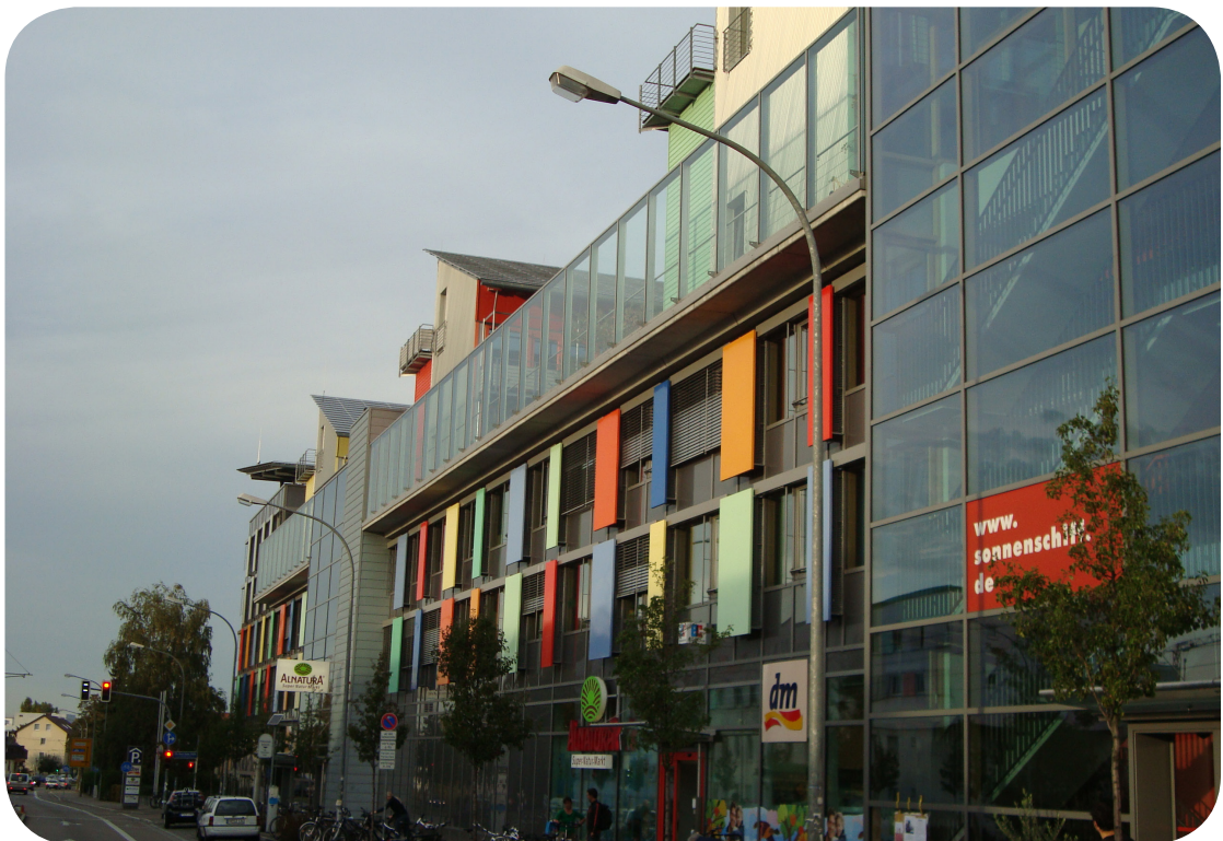
The "solar ship" mixed use building in Vauban's solar settlement.

To reduce reliance on private cars, Vauban was designed to be a district of short distances. A combination of public transport (buses and a tram line completed in 2006), a car sharing scheme, and shortening distances between residential areas and local amenities. Two considerable incentives help reduce car use: the parking-free residential streets and the car-free living scheme. In the parking-free residential streets, cars are only allowed for the loading and unloading of goods and the speed limit is restricted to 30 km per hour. These regulations, originally planned for three residential streets, were extended to large parts of the second and third building sections of the district. Visitors can park on the main street or in the two garages on the outskirts of the district. Car owners living in the parking-free areas are expected to use the parking lots located in the district garages at a cost of approximately €20,000 (approximately US$26,000). If residents of the parking-free areas choose not to own a car, they sign a contract and become part of the car-free living scheme, paying a single fee of around €3,700 (approximately US$4,850). Regional legislation allows for the provision of car parking spaces to be separate from housing projects, but this is seldom implemented. Vauban's approach to traffic management is innovative in the scale at which the reduced car concept has been applied. 38