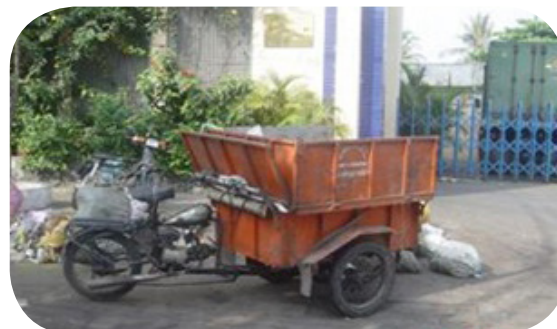
Solid waste collection by motor tricycle