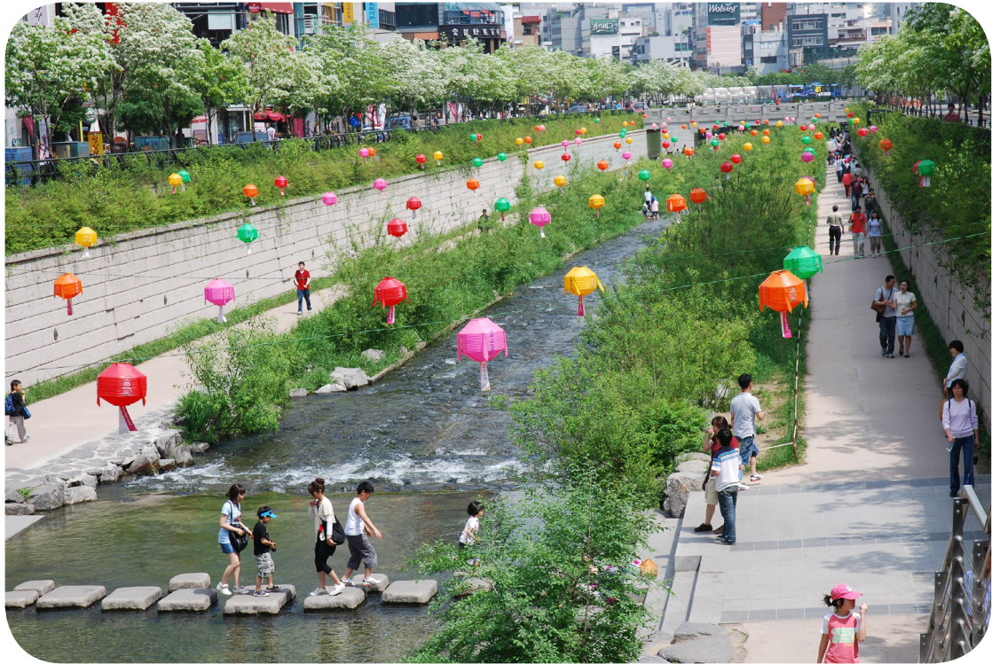
The Cheonggyecheon after restoration

discuss issues relating to the Cheonggyecheon and recommend solutions. 332 The public now have access to valuable educational resources through their renewed contact with nature, restored historical sites, and the Cheonggyecheon Museum. 333