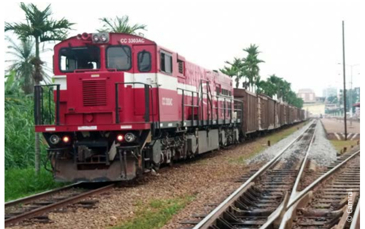
Freight transport in Cameroon

Shift to low-carbon transport modes through promotion of: