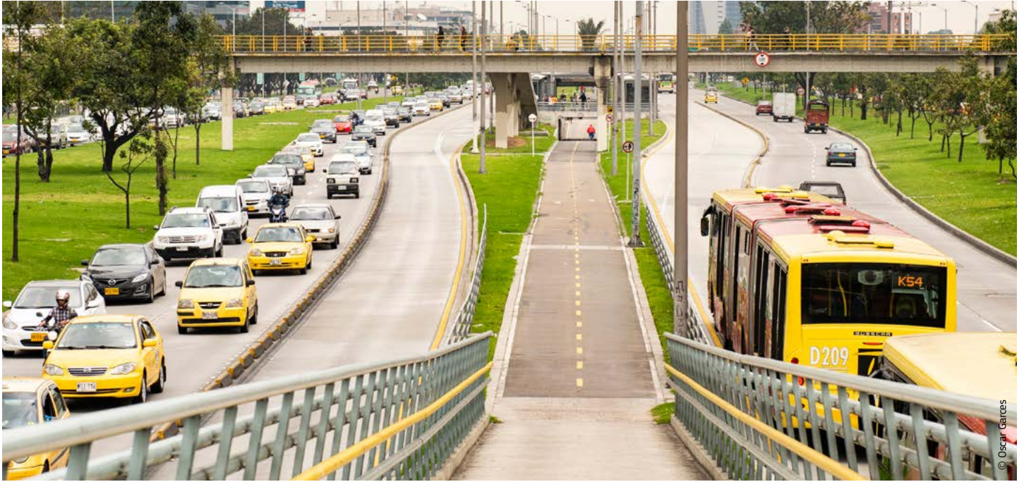
Multi-modal transport in Colombia