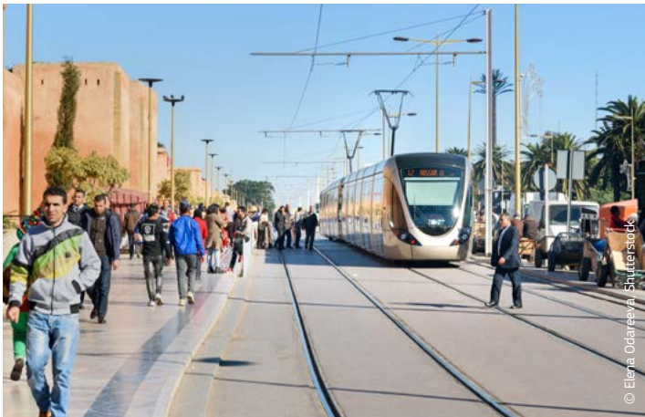
Tramway in Rabat, Morocco