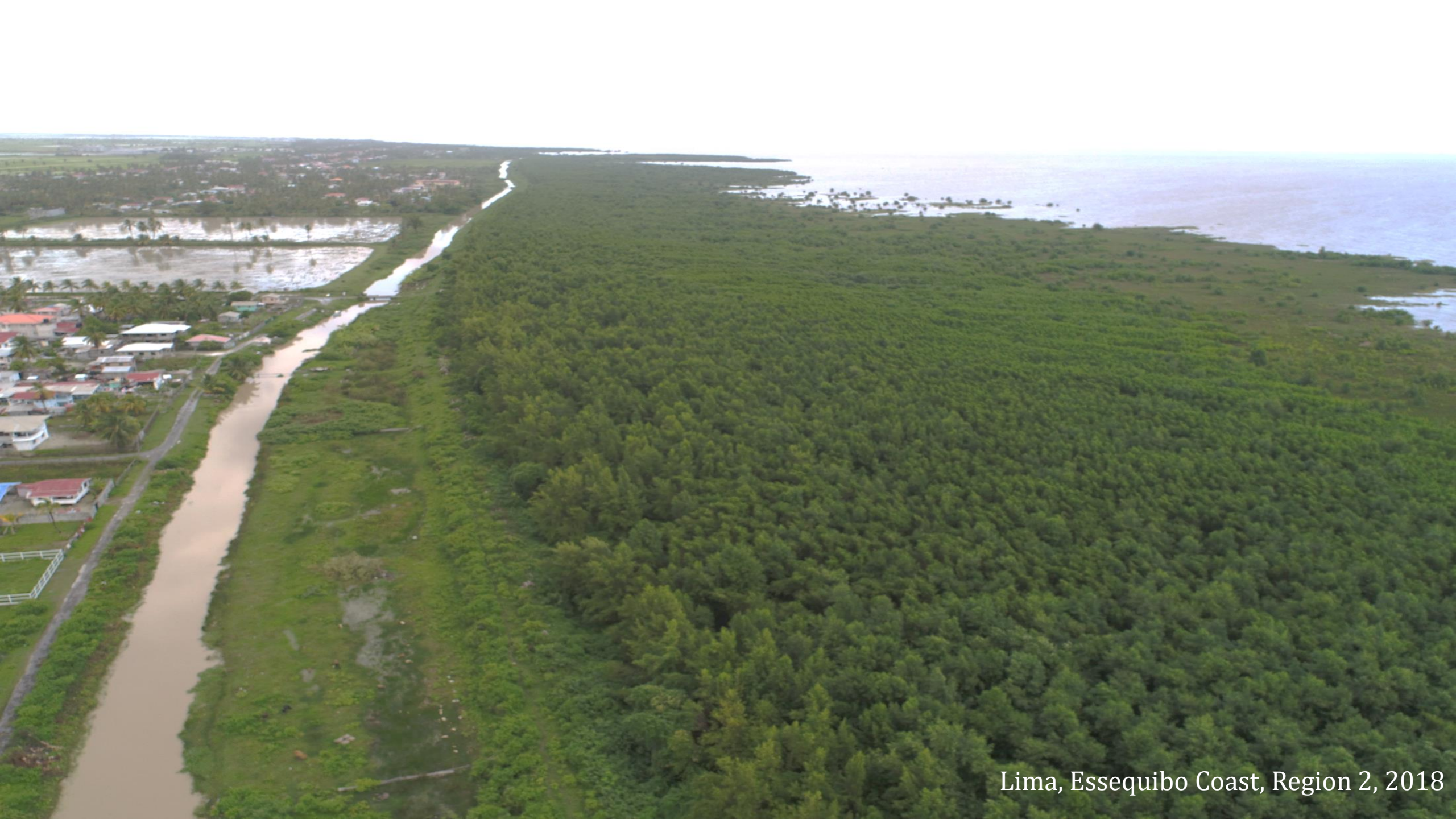
Lima, Essequibo Coast, Region 2, 2018