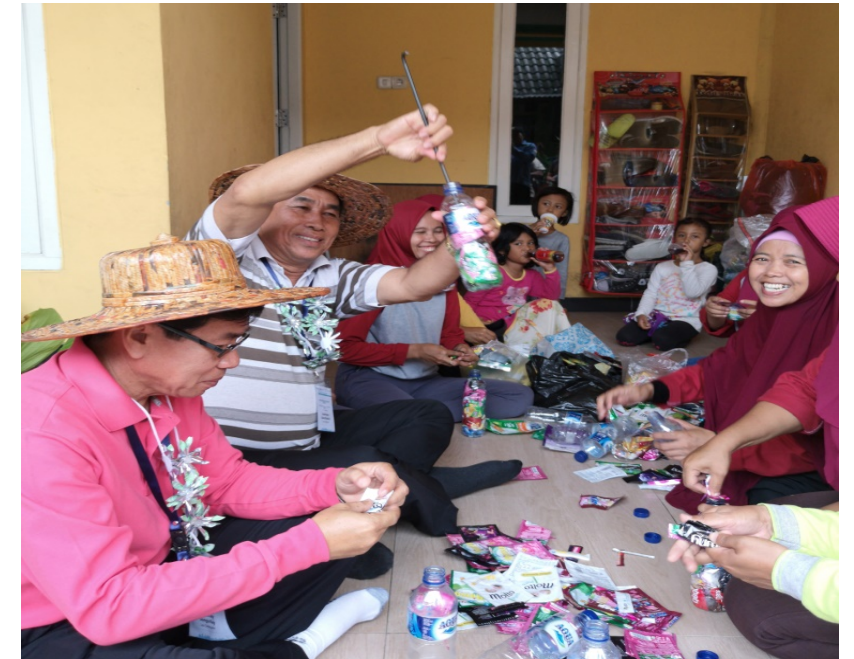
Vice Mayor of Kaysone Phomvihane, Lao PDR, and Mayor of Pakse City (1 st and 2 nd from left) are taught by women community leaders from Nana's Village how to make eco-bricks from water bottles and single-use plastic.