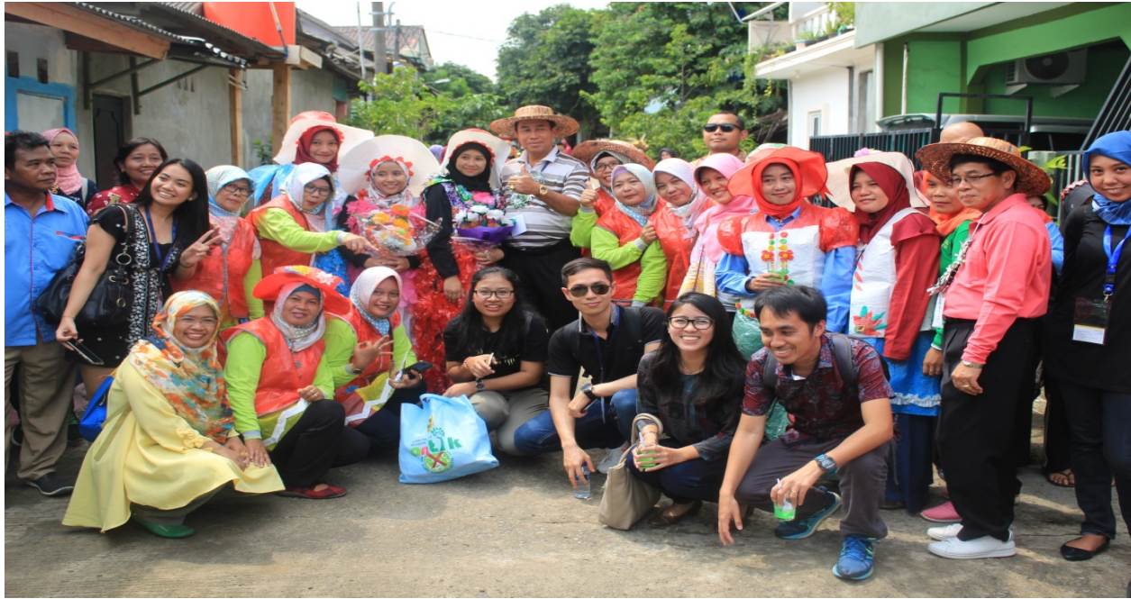
Mayor of Pakse City, Lao PDR (middle), donning a recycled paper hat, poses with the people from Nana's Village of Bogor Regency, Indonesia, garbed in colorful outfits made from recycled plastic and tetra packs.