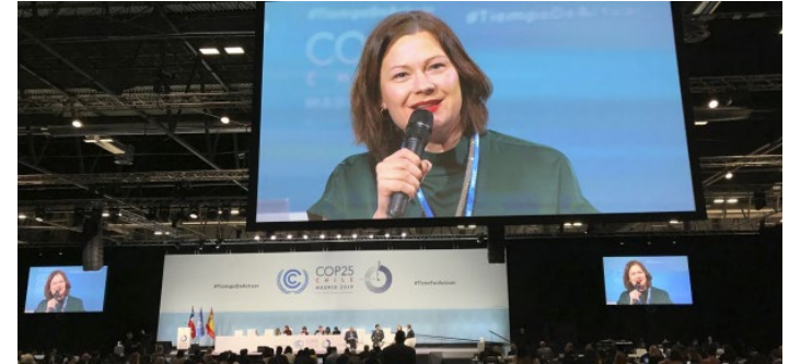
Mayor Minna Arve at COP25 in Madrid, sharing Turku's efforts to link the circular economy with its carbon neutrality goals as part of the Circular Turku project