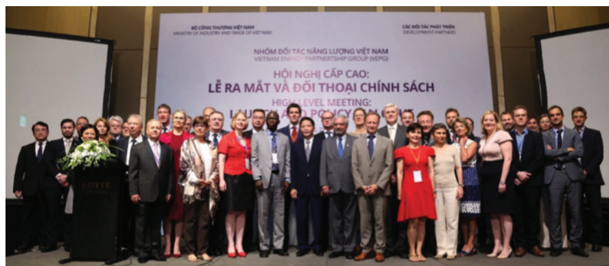
The European Union's Delegation to Vietnam and the Ministry of Industry and Trade (MOIT) held the ceremony of Vietnam Energy Partner Group (VEPG) with the participation of more than a hundred representatives from Vietnam government agencies, organisations of development partners, finance, private sector and NGOs (June 2017).

A second EU TAF team has initiated the 'Vietnam Energy Information System (VEIS)', to prepare and propose to the Government of Vietnam a Road Map and Action Plan to develop a VEIS in Vietnam. This Road Map and Action Plan are scheduled to be discussed with Vietnamese and International Stakeholders in a Workshop to be held in Hanoi in March 2018.