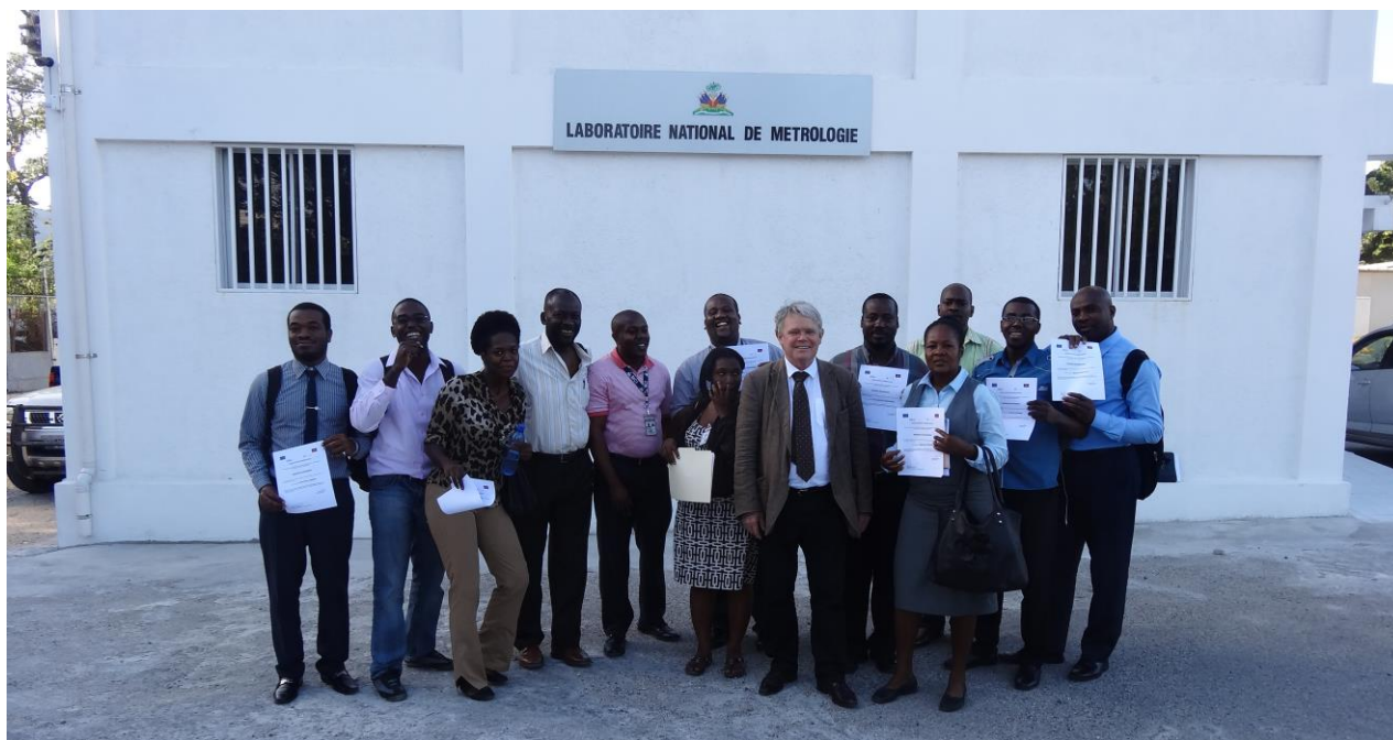
Mission to the national Bureau of Standards, Haiti, April 2016

In November 2015, the TBT Programme launched a project to support the Haitian Bureau of Standards (BHN). The purpose of this EDF-funded intervention are (a) to strengthen the BHN Quality Management institutional capacity; and (b) to promote the adoption of best international practices in the production and provision of goods and services.