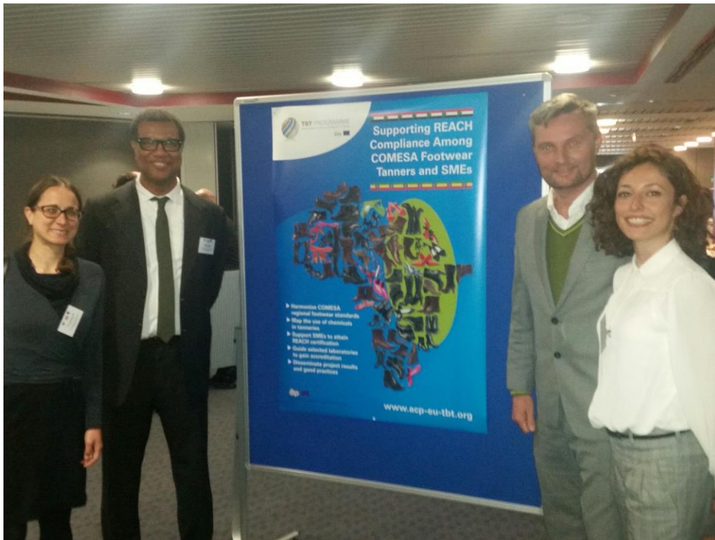
TBT Programme team at the conference marketplace of ideas, Brussels, 25 th of April

On April 25, 2016, the European Commission organised its first "High-level Conference on Responsible Management of the Supply Chain in the Garment Sector". Held one day after the third anniversary of the collapse of the Rana Plaza factory in Bangladesh, the conference promoted successful existing initiatives, including from Member States and industry and provided a platform for continuing the dialogue at EU level.