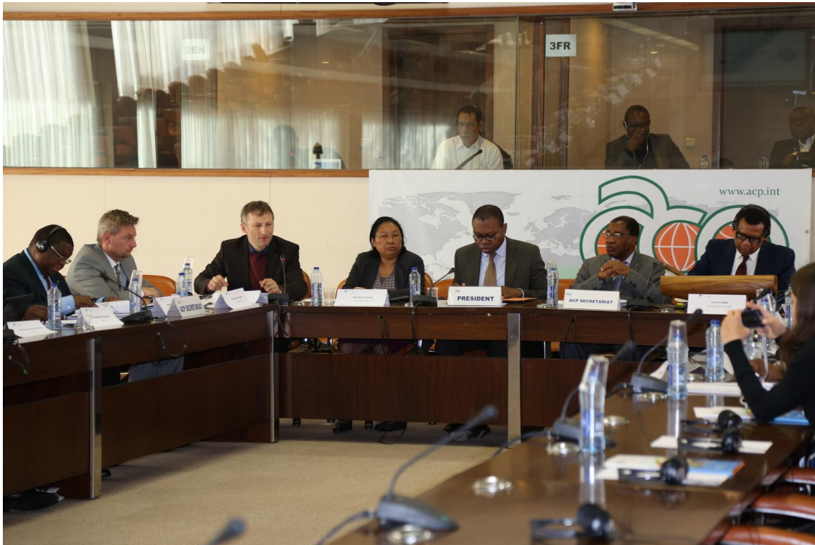
6 th Steering Committee, ACP House, Brussels, 21 st of April 2016