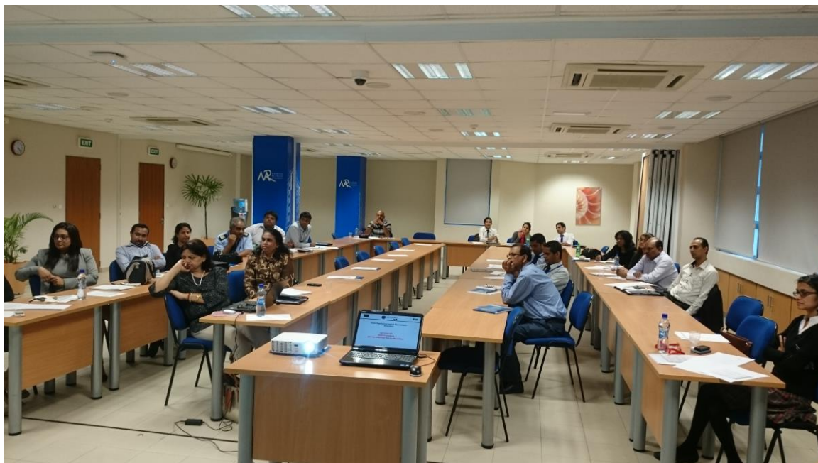
RIA Training, Mauritius, September 2015