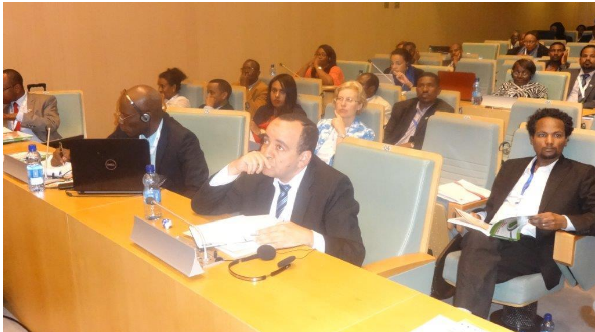
21 st General Assembly of ARSO, August 2015

The TBT Programme participated in the 21st General Assembly of the African Organization for Standardisation (ARSO), held in Addis Ababa, Ethiopia, August 10-14, 2015.