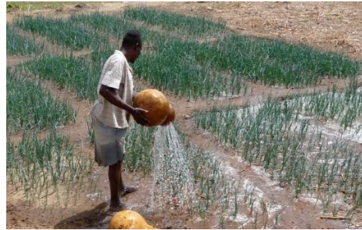
Watering onions in Burkina Faso

The main objective is to find ways to deal with the technical, financial, economic, organizational and institutional constraints that limit the development of small-scale irrigation in Burkina Faso. The specific objective is to establish operational and institutional support mechanisms for innovation that will place producers at the center of the innovation system for the development of solutions for irrigation adapted to different productive, economic, social and environmental contexts.