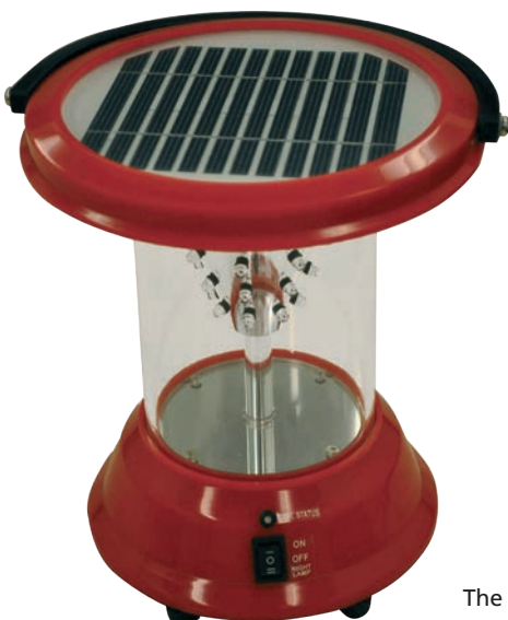
The Solar Lantern: US$39