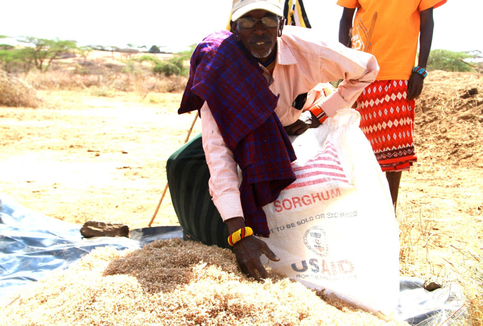
A community member in Isiolo County, Kenya, prepares grass seeds for planting animal fodder at Mlima Chui fodder production demonstration site. Livestock is a major source of income for pastoralist families in Northern Kenya. However, cycles of drought make it difficult for them to provide sufficient pasture for their animals.