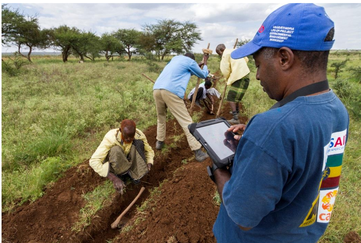
USAID’s partners in the field use WATEX and iGens technology to locate sites suitable for the development of water schemes—including this one near Waji, a village in Ethiopia’s Somali Region. When the Waji scheme is finished, its 6 kilometers of pipeline will deliver water to three water points and four animal troughs and serve more than 12,000 people in six communities. CREDIT: USAID • KELLY LYNCH

Sanitation and hygiene (discussed above) are key mediators of health-related well-being, including undernutrition. Household and community health-related shocks have an equally negatively impact on realization of the full benefits of increased economic opportunities (Objective 1).