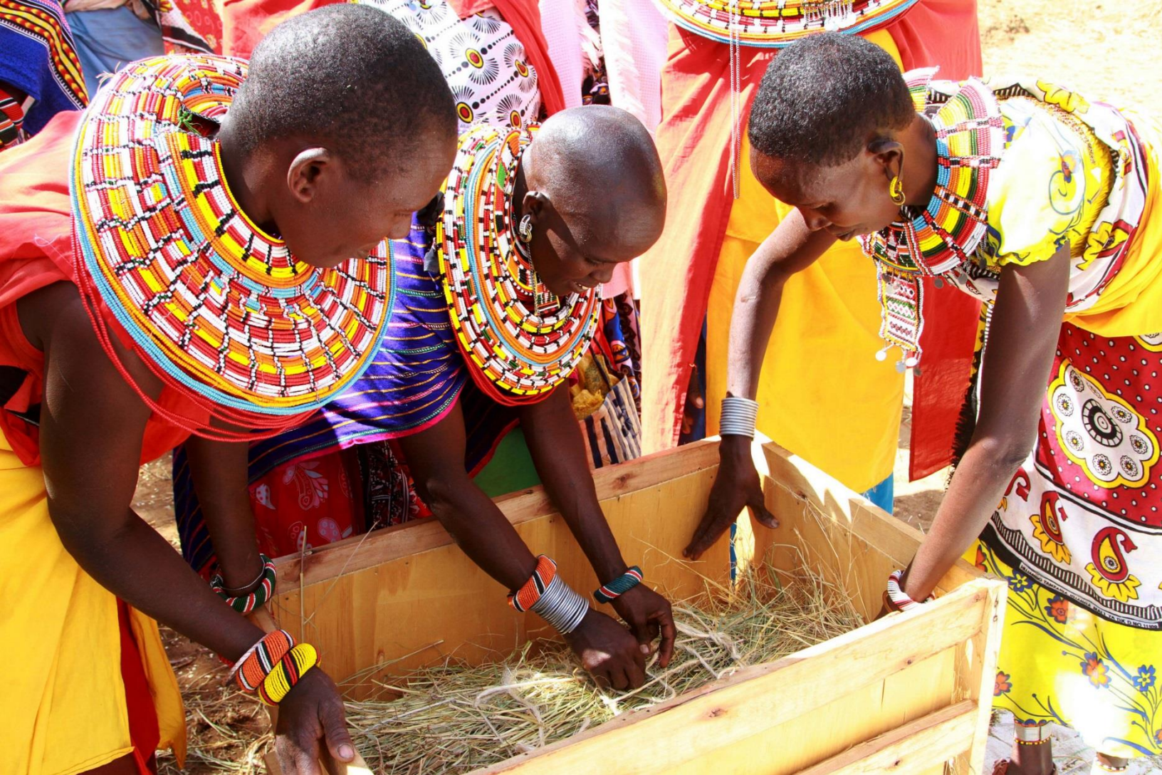
Women engage in preparation of hay bales at Mlima Chui fodder production demonstration site. Livestock is a major source of income for pastoralist families in Northern Kenya. However, cycles of drought make it difficult for them to provide sufficient pasture for their animals. Cultivating land that is well-suited for grazing helps these communities keep their herds healthy by restoring grass cover in dry areas.