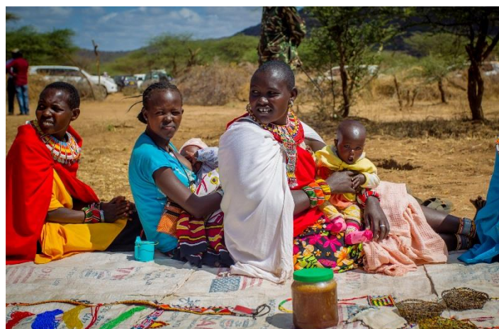
Kenyan women in Oldonyiro, Isiolo County, make and sell their elaborate beadwork as an alternative source of income for their families, in addition to livestock keeping. To be resilient in Northern Kenya, where droughts are striking more frequently, families need adequate resources to fall back on in times of need.

Recent research suggests that individual welfare and resilience are closely related to an individual's aspirations for the future. Research has shown that positive aspirations are associated with greater resilience to shocks and stresses.