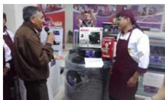
Equipment delivery ceremony