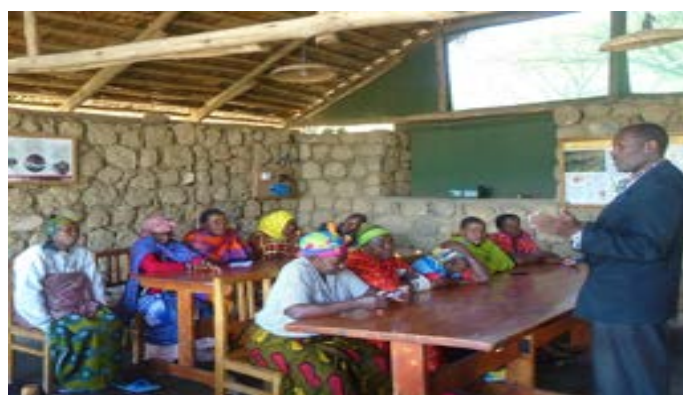
Marketplace Literacy Training by Oikos Est Africa in Tanzania

Oikos East Africa project targets 5,000 Maasai women located in Northern Tanzania. They rely exclusively on informal subsistence economies and are vulnerable to social, economic and environmental shocks. A key part of the programme is the Marketplace Literacy Training. The development of new skills in the field of market literacy will allow women to better deal with the "marketplace" environment as conscious and active players and to get a basic education to successfully run sustainable small business activities. Oikos East Africa is proudly closing in these days the first session of Training of Trainers, spreading the first seeds of awareness.