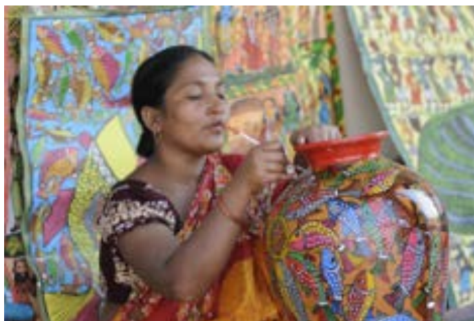
Supporting entrepreneurship development

USAID, DFID, World Vision (see also the World Vision Australia article in this newsletter), CARE, Save the Children, OXFAM, SEWA and other agencies have developed various types of relevant training materials. Unfortunately, in some cases these materials have stayed within specific projects and are not widely disseminated. We invite all readers to share their tools on the Cap4Dev IESF platform .