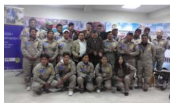
Awarding of professional certificates

The project "Production with training, an opportunity for decent work and social inclusion" is run by the FAUTAPO Foundation, funded by the European Union, and co-financed by municipal governments of the cities of Oruro and Potosi. Throughout a public ceremony held on the occasion of the conclusion of the first call for projects, equipment was delivered to 241 production units, operating in sectors such as food & beverage, garment, metal industry and construction, after the completion of the training process, one of the key items of the capacity building plan. The event ended with the awarding of certificates to first-level and auxiliary technicians.