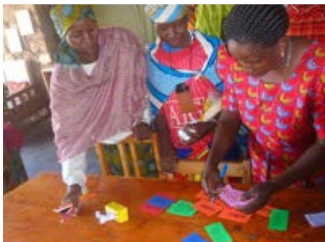
Marketplace literacy training of trainers