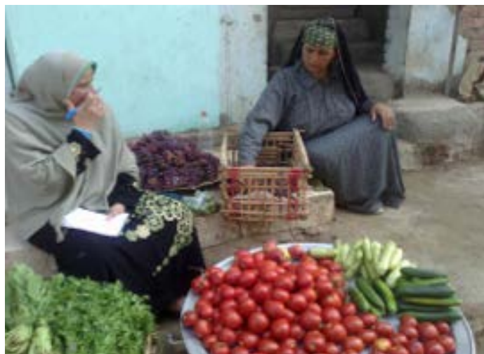
Egyptian women play an important role in the informal economy