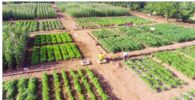
Photo: An example of CGIAR integration of released technologies at Lisasadzi Residential Training Center in Kasungu under the EU funded KULIMA program.

The smallholder farmers' agri-food system in Malawi faces persistent and new biophysical and socio-economic constraints resulting in low productivity and high production risks. These constraints endanger the food and nutrition security and income of smallholder farmers and the socio-economic growth of the country. These constraints are combined with a progressive degradation of natural resources putting at high risk the future of agriculture and food systems in the country.