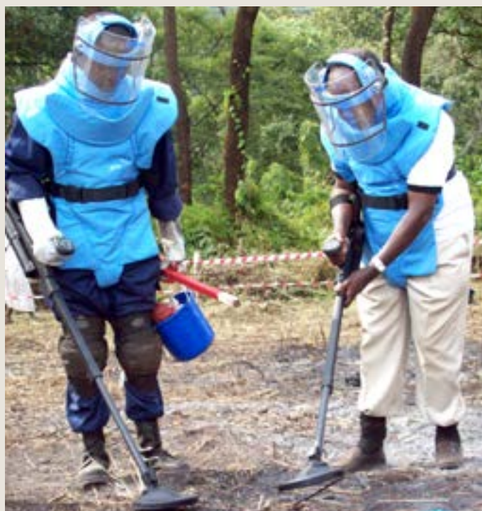
In the years following the 2006 ceasefire agreement between the government of Uganda and the Lord's Resistance Army, the Uganda Mine Action Programme cleared out land mines so that IDPs who wanted to return home could do so. Photo: IRIN/Charles Akena, December 2010

In the words of a Ugandan advocate for IDPs' rights, "it is therefore paramount for the government of Uganda to take critical leadership in providing the first IDP law in terms of domestication, as it took leadership in ratifying the Kampala Convention". In doing so, it should continue to collaborate with regional institutions and take advantage of the potential support such cooperation offers. It should also revive discussions with all relevant stakeholders at the local and national level, including IDPs and other displacement-affected communities.