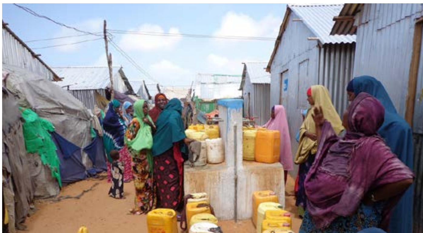
A solar-powered water pumping system has been set up in response to the 2011 drought, providing reliable water access to the local community of the Zona-K IDP camp, Somalia. Photo: NRC/N. Tado, April 2011

It is the tenet of good policymaking to leverage rather than duplicate existing policies and mechanisms in pursuit of shared objectives. In its official statement to the Fourth Session of the Global Platform on Disaster Risk Reduction in May 2013, the AU underlined the link between internal displacement in Africa, global efforts to reduce disaster risk under the current Hyogo Framework for Action (HFA 2005-2015) and work towards a successor framework. The statement called specific attention to the ratification of the Kampala Convention, which "acknowledges the responsibilities of governments to protect people displaced by natural disasters and climate change and take measures to mitigate such displacement". 38 At the same time, and aligned with the HFA, AU member states are implementing a regional DRR strategy 39 through an Extended Programme of Action (2006-2015). 40 Its objective is "to contribute to the attainment of sustainable development and poverty eradication through substantial reduction of social, economic and environmental impacts of disasters", including risks associated with climate change.