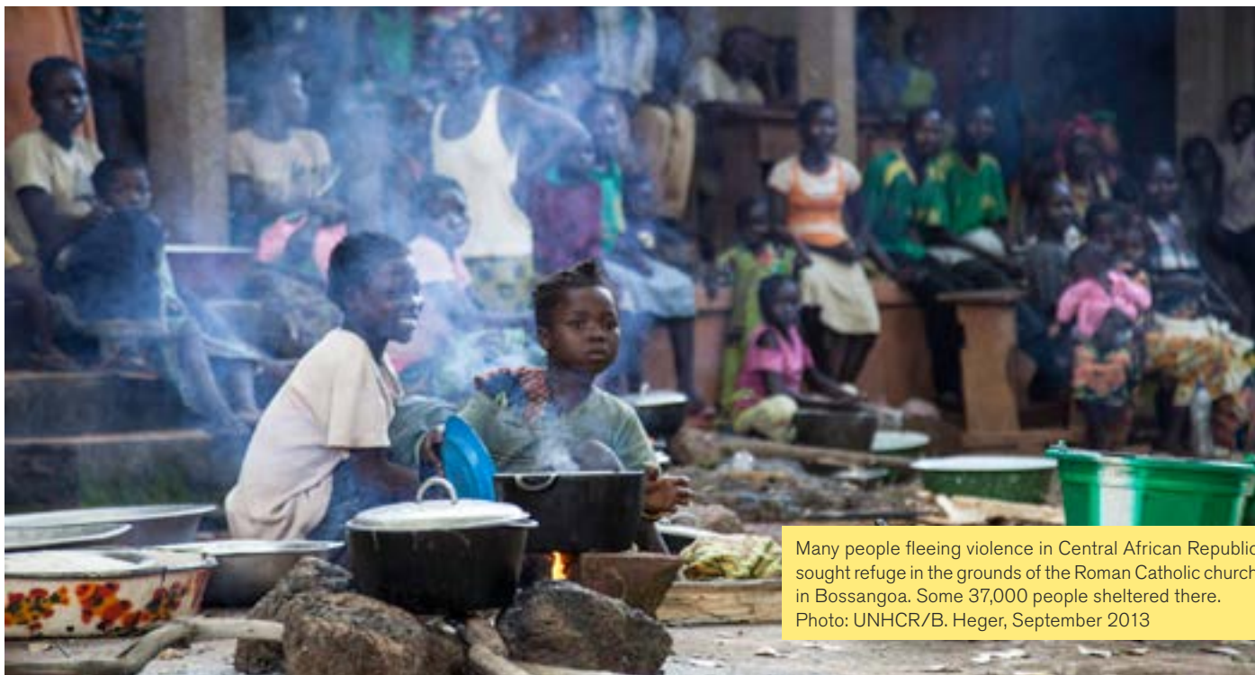
Many people fleeing violence in Central African Republic sought refuge in the grounds of the Roman Catholic church in Bossangoa. Some 37,000 people sheltered there. Photo: UNHCR/B. Heger, September 2013

able groups can pose considerable challenges. Data for natural disasters refers only to those newly displaced: there is no tracking of the duration of displacement in the longer term, and there are frequently no cumulative totals. In conflict settings, even in chronic contexts such as DRC, data generally focuses on new displacement and in most contexts is cumulated year-to-year. This may give a reasonable overview of new displacement over the last five years, but there is little understanding of what may have happened to people still living in displacement as a result of earlier waves of violence, and little quantitative or qualitative data on displacement dynamics beyond IDPs' initial flight. Data relating to settlement options and durable solutions is particularly scarce. IDPs living in protracted displacement are often forced to flee a number of times, but the extent of secondary displacement and its impact on those affected is difficult to assess. The phenomenon is particularly opaque in the burgeoning urban settings of many African cities, where rapid and often unregulated urbanisation can be both a consequence and a cause of displacement.