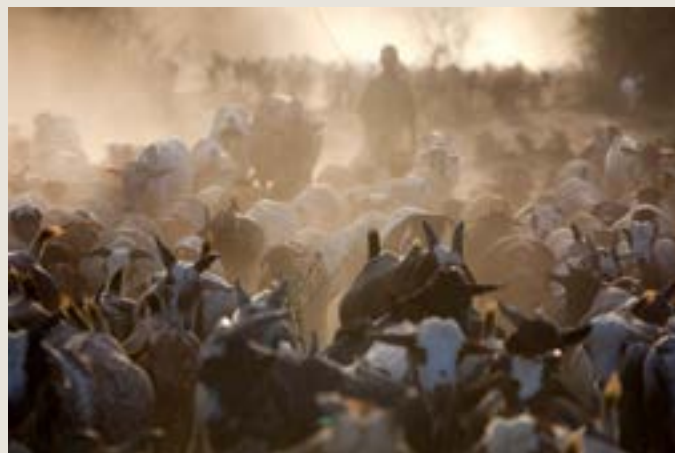
Turkana herdsmen with their cattle in northern Kenya. Pastoralist movements cease to be normal once factors that give rise to them are 'coercive' in nature. Photo: IRIN/Gwenn Dubourthoumieu, July 2010

For example, Kenya has introduced constitutional and legal reforms on land rights, but pastoralists remain vulnerable to losing theirs as a result of expropriation, appropriation or dispossession by both public and private entities 70 . The typical justification is that such actions make way for more efficient, productive and sustainable use of the land. The introduction of commercial