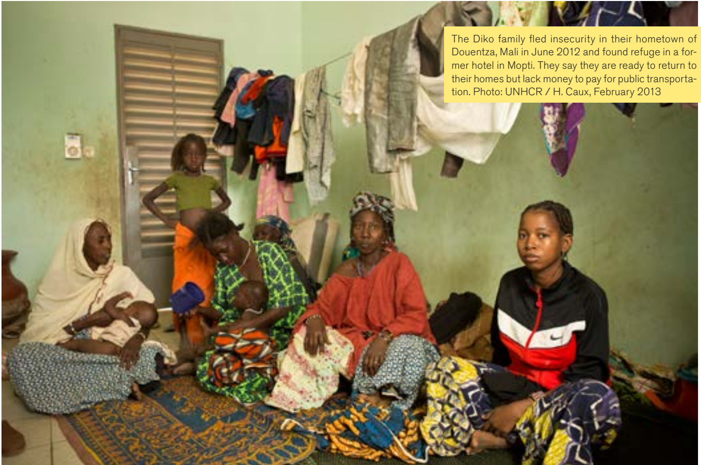
The Diko family fled insecurity in their hometown of Douentza, Mali in June 2012 and found refuge in a former hotel in Mopti. They say they are ready to return to their homes but lack money to pay for public transportation. February 2013

state's obligations during displacement, and Article 11.2 restates the same duty in the context of the search for durable solutions. 19