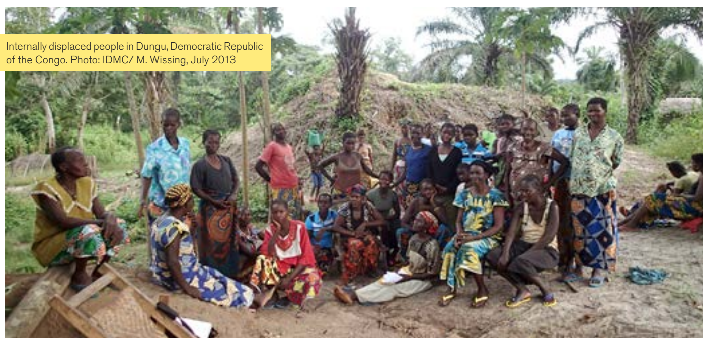
Internally displaced people in Dungu, Democratic Republic of the Congo. Photo: IDMC/ M. Wissing, July 2013

The Kampala Convention draws on both IHRL and IHL to refer to all those involved in response, while highlighting primarily the obligations of states themselves. In addition to the groundbreaking fact that it is legally binding, the convention is unique in its comprehensiveness. It clearly outlines roles and responsibilities for national authorities, but also specifically refers to those of non-state armed groups, private companies, civil society organisations, the international community, and IDPs and communities affected by displacement themselves. It also reflects the diverse and frequently multiple causes of displacement in Africa, explicitly referring to armed conflict, generalised violence, human rights violations, natural and human-made disasters including climate change and public and private sector development. As such, it reminds us that forced displacement is not only a humanitarian issue, but must be viewed through a human rights