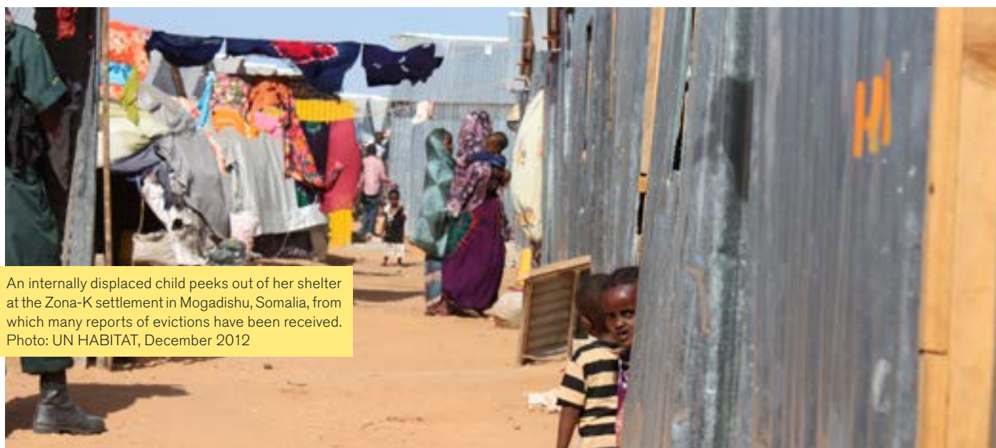
An internally displaced child peeks out from her shelter at the Zona-K settlement in Mogadishu, Somalia, from which many reports of evictions have been received. Photo: UN HABITAT, December 2012

The Kampala Convention takes bold steps to condemn and comprehensively address arbitrary displacement, forced evictions and their consequences, including by committing states to examine how they carry out development and other projects through a human rights lens. This is perhaps the most powerful illustration of the overall commitment of AU member states to protect and assist IDPs and refugees in an increasingly complex environment where causes of displacement often overlap. By recognising the multiple and interlinked causes of displacement and assigning clear responsibilities to state and non-state entities, it provides an excellent framework to design comprehensive laws, policies and responses to address the various types of internal displacement.