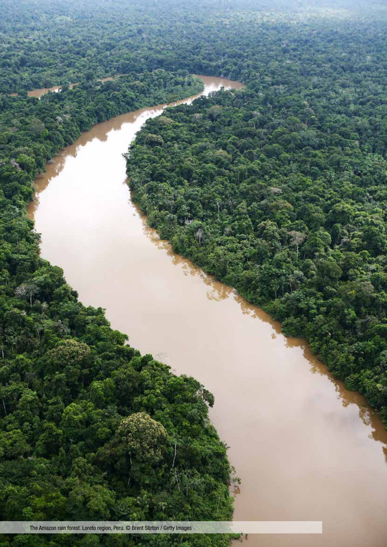
The Amazon rain forest. Loreto region, Peru.