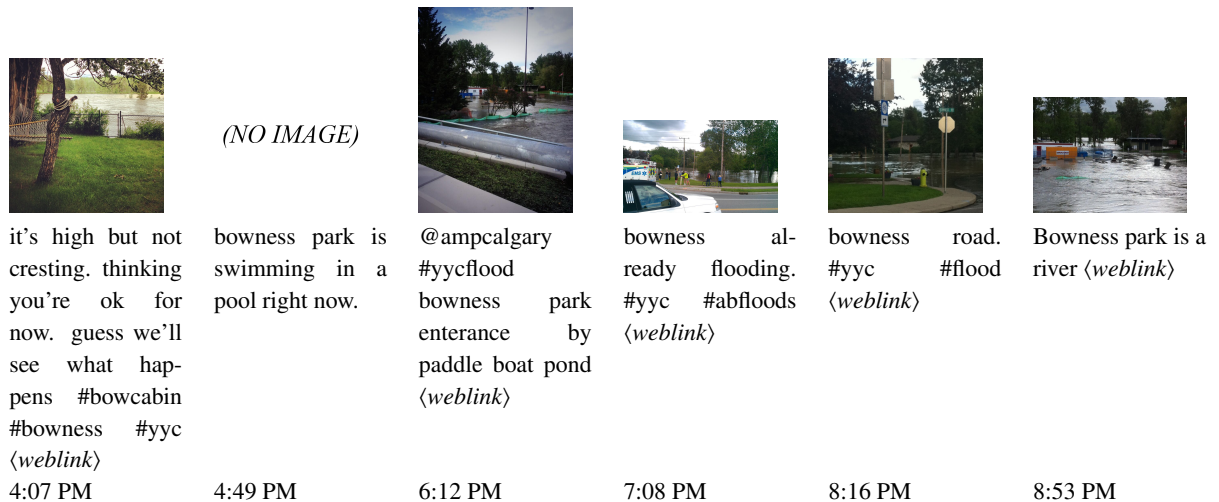
Fig. 2. Tweets reporting the status of flooding in and around the Bowness neighbourhood on June 20, 2013. Bowness is a suburban area near Calgary. Notable is the absence of flooding hashtags/keywords as well as the dependence on images to convey current conditions.

Uneven and uncertain coverage of an area. Presumably the reason for disproportionate numbers of “porch” photos has to do with people’s inability or unwillingness to move around during the flood. In fact, during the peak of the crisis, the Calgary municipal leadership regularly instructed citizens to stay in their houses for safety reasons. The combination of these and other factors produced a population of Twitter users who could only post pictures from a fixed viewpoint. Where situational awareness is concerned, this produced a systemic issue: for all the locations considered, individual tweets reported rather random perspectives - both in text and photos. Users did not have the luxury to survey their surrounding area and find particularly informative vantage points or collect particularly meaningful data. This was quite pronounced when looking at neighbourhoods, in which the aggregated tweet stream is primarily a sequence of pictures of users’ backyards (which are by-and-large, spatially disjoint).