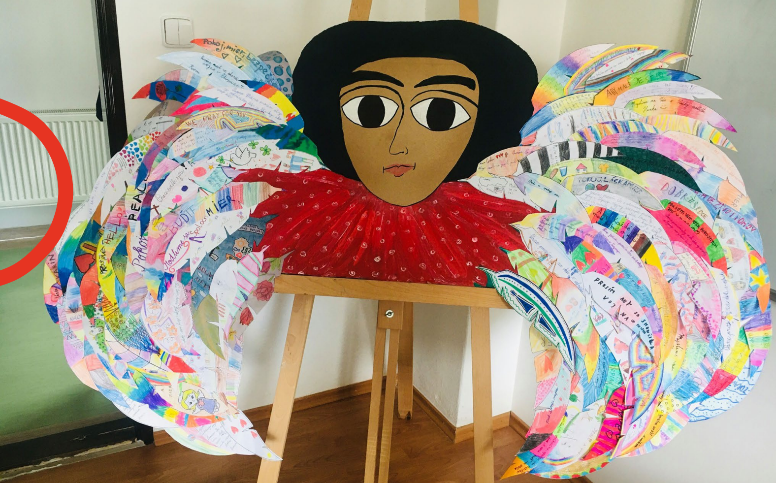
The result of eRko's campaign for children – Peace for Tigray (Mier pre Tigráj).