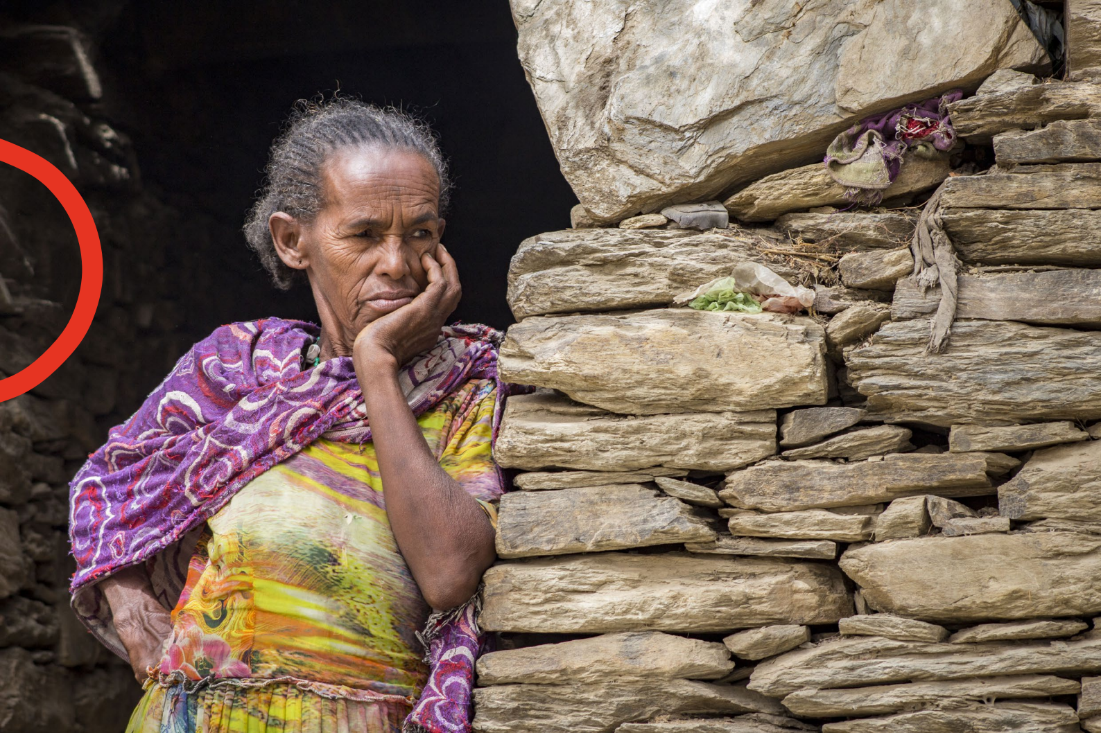
The oldest inhabitants of Tigray have experienced several regime changes and conflicts during their lives.