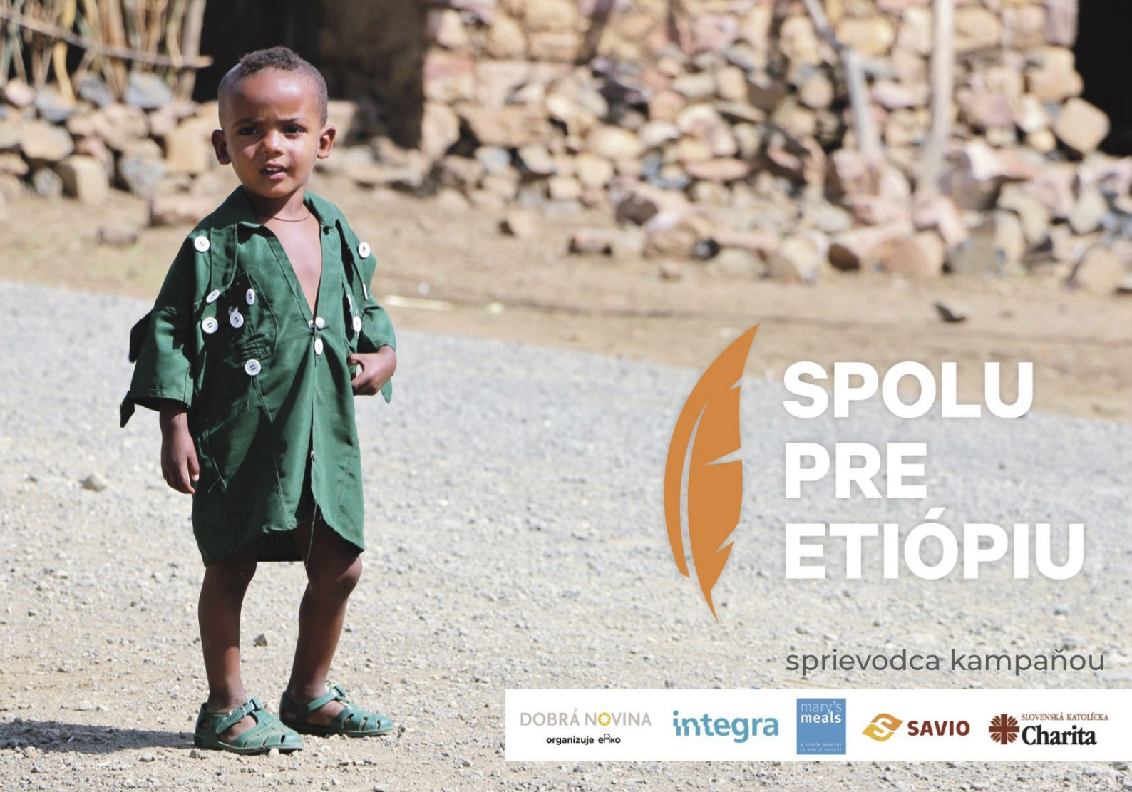
Joint visual design – a flyer promoting the Together for Ethiopia campaign.

through a volunteering programme, the annual public collection Brick and remote adoption of children and classes. SAVIO also actively strives to raise the awareness among the Slovak public about development issues and the need for development cooperation. In addition to numerous projects and activities in Slovakia, the Caritas Slovakia 26 also implements humanitarian aid and development cooperation in the countries of the Global South. The most important development activities include the Distance Adoption programme and the Lenten Box for Africa collection. Like the members of Ambrella – eRko and SAVIO – Caritas Slovakia also annually prepares and sends international volunteers to the African continent. The Integra Foundation 27 has developed its Malaika adoption programme on the African continent and in Ethiopia it has long supported education for 371 children thanks to Slovak donors. It is a member of the International Humanitarian Alliance Integral, with which it cooperates in crises and wars (currently in Ethiopia and Lebanon). The fifth Slovak organisation, Mary's Meals Slovakia , 28 was involved in the initiative with its umbrella organisation Mary's Meals International. The latter has long provided school meals to two million children in various parts of the world living in extreme poverty (including 24 320 children in the Tigray region) as part of its school meals programme.