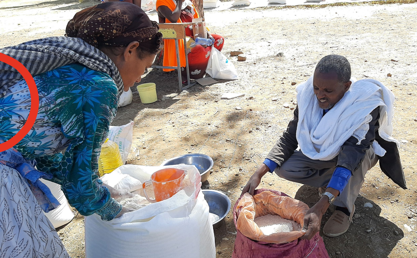
Distribution of food to internally displaced persons (IDPs) from Tigray.

deliveries due to an increase in deadly drone attacks on refugee camps and shelters for victims of the conflict. They are updating the situation in the region on a weekly basis – mapping the needs of the emergency as well as noting possible and impossible access points for aid supplies. 56