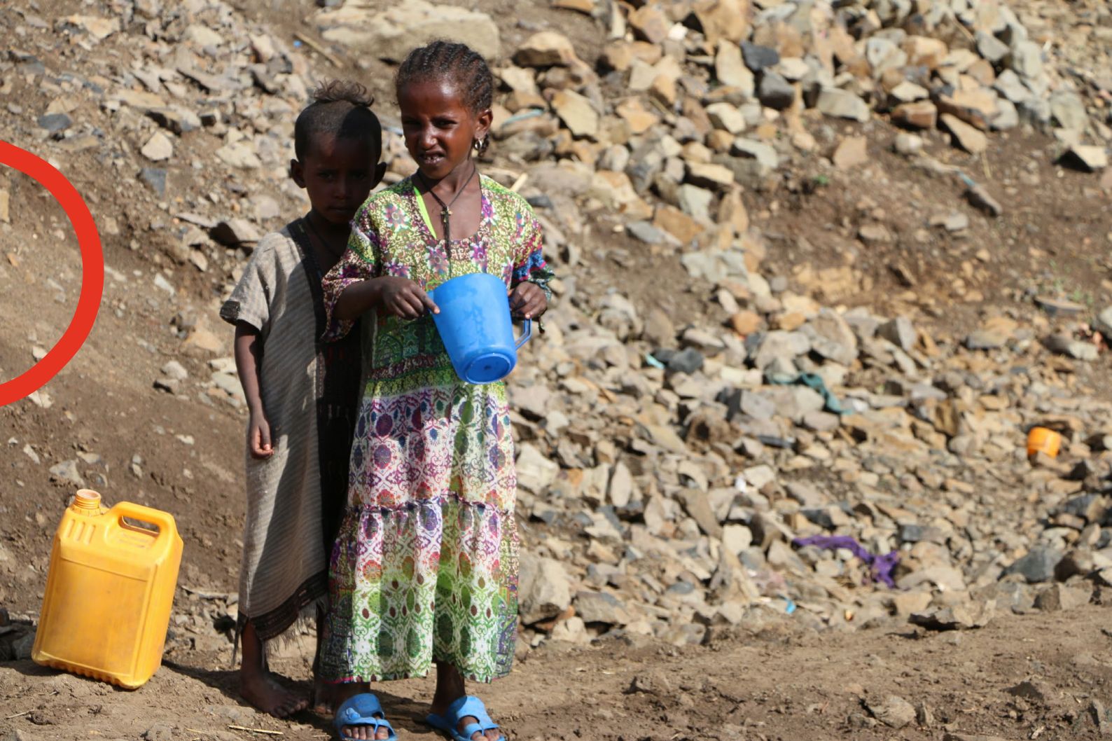
Women, girls and children are suffering the most during the military conflict in northern Ethiopia.

displaced within their own country, seeking shelters in major cities. Tens of thousands have also fled to neighbouring Sudan. There are growing concerns in the region not only about impending famine, but also of the rapid community spread of the covid-19 pandemic, as people accumulate in large numbers in makeshift camps without clean water, sanitation and medical facilities. According to UN estimates from the spring of 2021, almost five million people 22,23 in the region were in need of assistance, which can be compared the population of the whole of Slovakia.