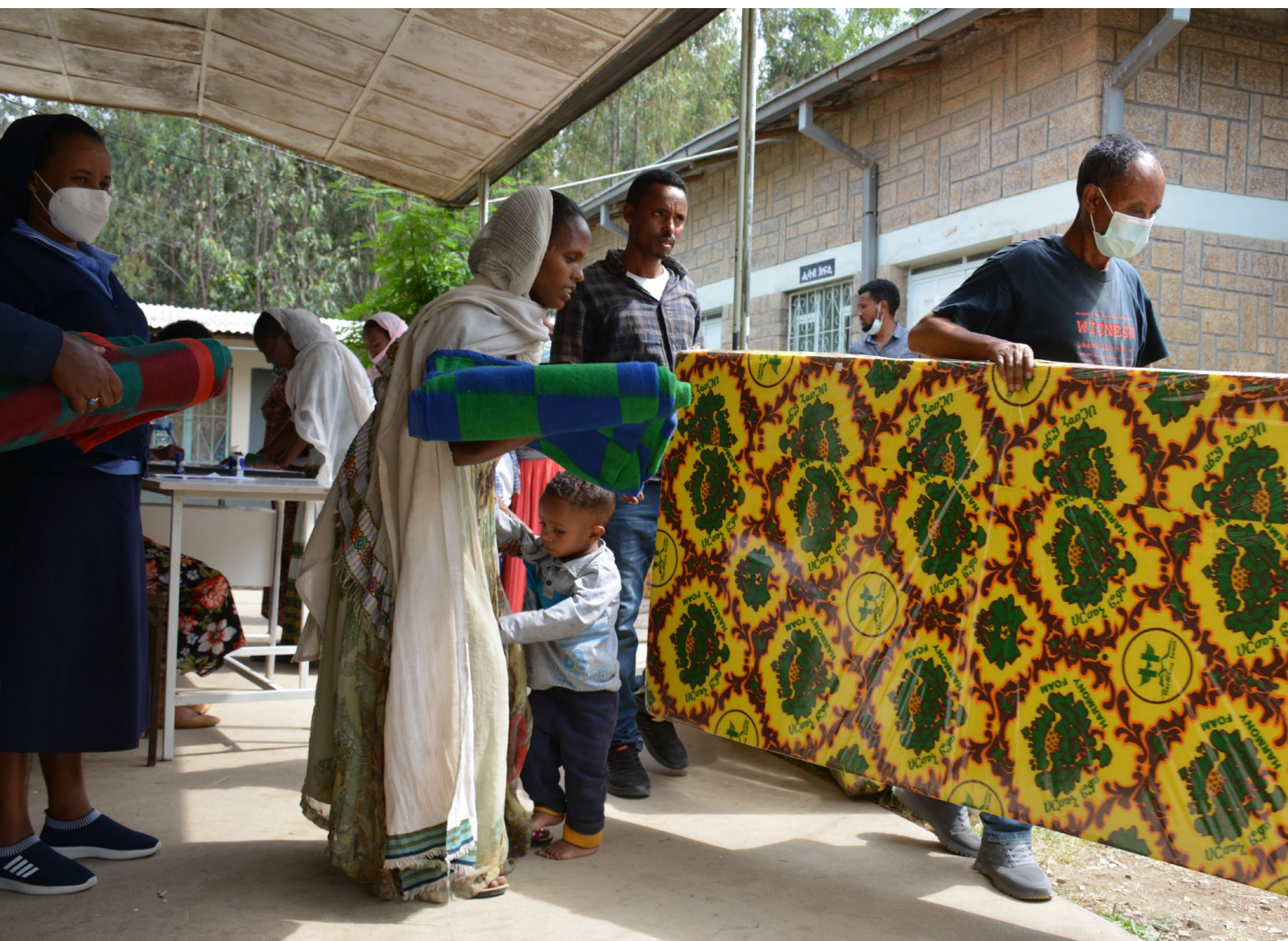
Distribution of humanitarian aid to Tigray families in Mekelle.

Mary's Meals International provided food aid to 16,000 people on the run in the conflict zone in Mekelle, Ethiopia, as well as other basic necessities for IDPs who had fled their homes and were seeking refuge in the capital of the threatened region. Mary's Meals International closely cooperates with the Congregation of the Daughters of Charity of St. Vincent (Daughters of Charity Tigray Region). 48 The Daughters of Charity Tigray Region are also a key partner for the other Slovak organisations involved. Caritas Slovakia supported the Together for Ethiopia initiative in the Lenten Box for Africa public collection, which has been helping the poor and needy in sub-Saharan Africa for the past ten years, with 10,000 euros – going specifically to the project of Daughters of Charity Tigray Region – to provide basic necessities for people affected by the conflict in Mekelle and the surrounding area. 49