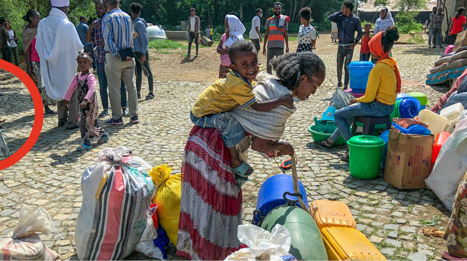
Distribution of food for internally displaced persons (IDPs) in Ethiopia.