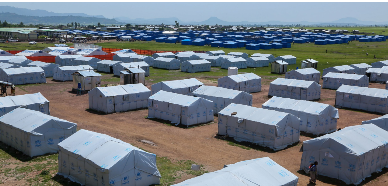
One of the refugee camps where Ethiopian people in need spend so many months.

Ethiopia, however, has had years of turbulent political development and no history of democracy to build on. And so, despite promising democratisation reforms and awards from abroad, it once again fell into the abyss of authoritarianism , culminating in ethnically-driven violence and subsequent humanitarian disaster in the north of the country 5 – in the Tigray region – in November 2020. 6