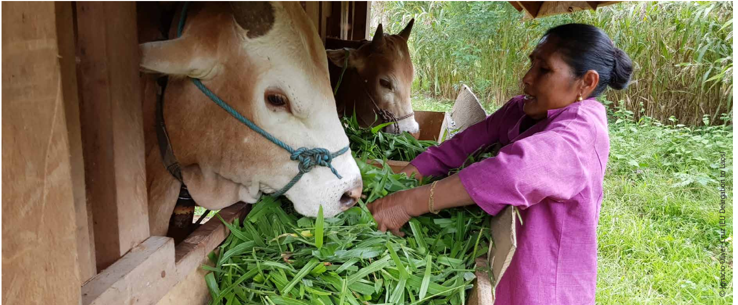
Landscape Management and Conservation Agriculture Development for Eco-Friendly Intensification and Climate Resilient Agricultural Systems in Lao PDR – EFICAS Project