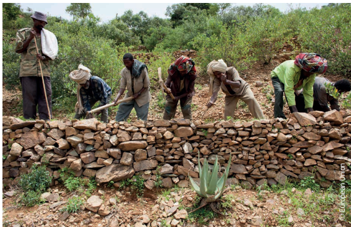
Stone terraces for soil and water conservation in Ethiopia