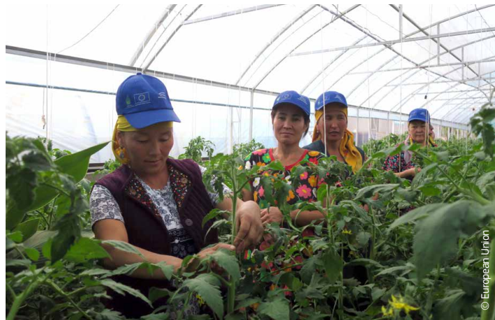
Sustainable agriculture in Kyrgyzstan