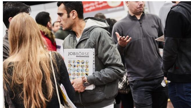
Employment fair for refugees and migrants in Berlin.