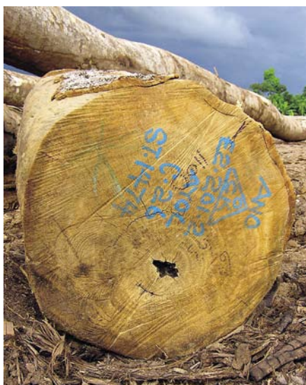
David Young, Global Witness

Reliable marking and recording of logs is a vital component of a timber tracking system and is a required module of legality assurance in FLEGT VPA countries. Marking using paint and/or a marking hammer is the most common method used in the forestry sector. Besides this technique recently developed marking methods like barcodes and Radio Frequency Identification (RFID) tags are now starting to be used to identify logs and reconcile the volume of wood in national supply chains.