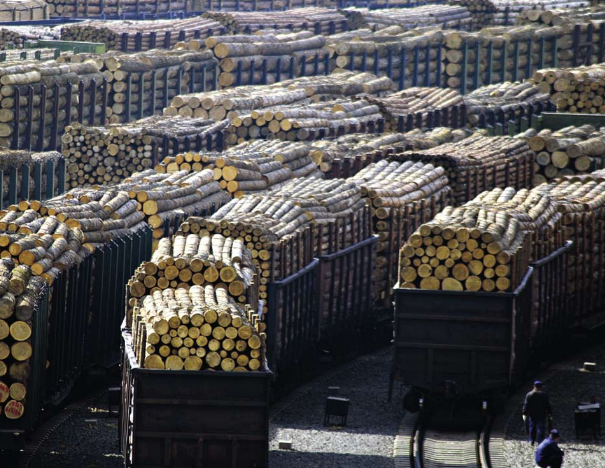
Environmental Investigation Agency