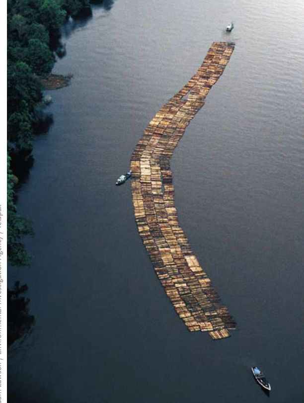
A raft of illegal ramin ( Gonystylus spp.) logs on the Seruyan River near Tanjung Puting National Park, Indonesia.