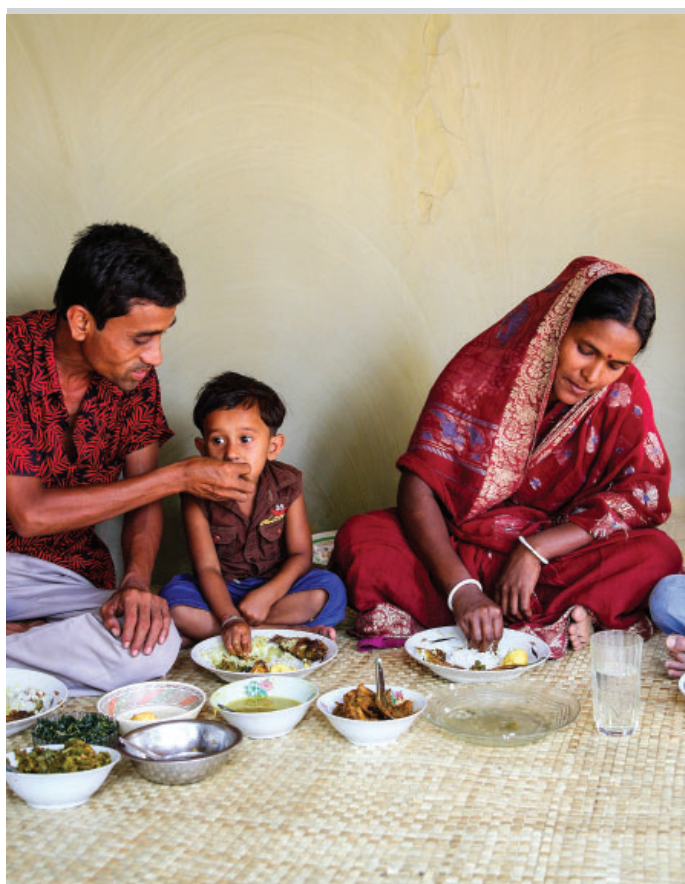
Positive behaviour, such as families eating together, and positive attitudes, such as parents taking a joint interest in their children's diet, can help improve household nutrition.

Early pregnancies also happen outside marriage in situations where girls have even less access to contraception. Research in Uganda found adolescent girls had very little knowledge about sexual and reproductive health issues, including how to prevent pregnancy. Mothers were reluctant to tell them and schools do not provide such education because of continuing perceptions that doing so would encourage young girls to engage in sexual relations. There was also a lack of quality health services and an ambiguity around providing adolescents with sexual and reproductive services in a context where sexual relations amongst under-18 year olds is illegal. 22