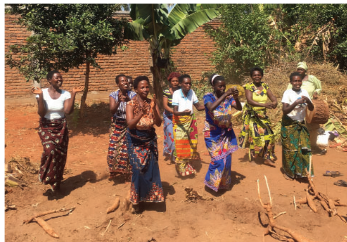
Members of the Tubehoneza cooperative (Burundi), supported by the SFOAP programme which helps in the production and sale of cassava. Women's control over agricultural production and income can help improve household nutrition.

Gender equality and the empowerment of women and girls matter for nutrition because they have an important bearing on the three underlying determinants of nutrition: food security ; care practices ; and health . These are summarised in Figure 1.