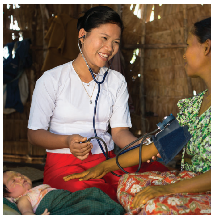
Auxiliary midwife providing a young mother and her newborn with essential health services in Myanmar. Women's ability to access health services is essential for good quality care.

In Indonesia, many pregnant women are underweight because of poor nutrition and limited healthcare. As a result, 5.5% of babies are born with low birth weights. Repeated pregnancies, pregnancies at a young age, and high workloads during pregnancy all contribute to the problem and are influenced by the decisions that women are able to make. 18