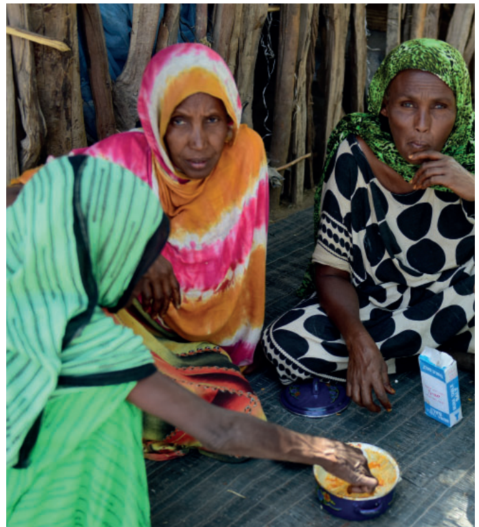
Ethiopia: Women’s nutrition status affects the nutrition status of their families.

Rural extension services can teach farmers how to produce more nutritious food, but these tend to be targeted more towards male rather than female farmers. This is not only because