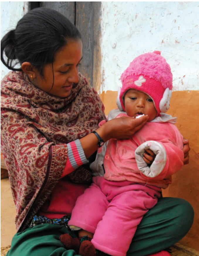
Nutritious infant feeding in Nepal. When women are empowered with knowledge and skills for a healthy diet, the health of their children improves.

negative social norms, these types of dialogues can encourage communities to challenge together the deep-rooted causes of discrimination, and trigger positive behaviour change. Inclusion of community leaders and service providers, such as teachers, local government officials, extension workers and nurses, can speed up the process.