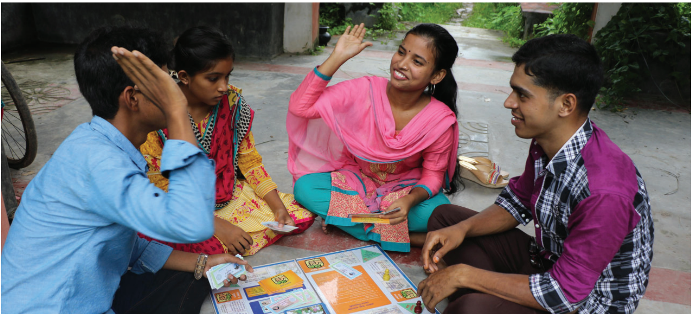
Providing services and training to improve sexual and reproductive health in Bangladesh. Empowering women and adolescent girls with more choice around reproduction can positively affect their health and the health of their children.