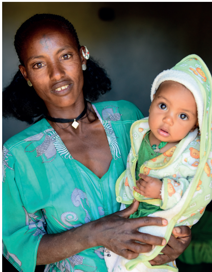
Ethiopia: Women's empowerment helps healthy babies grow into healthy adults.

This underlines the importance of a multi-disciplinary approach to tackling malnutrition. Such an approach needs to challenge those discriminatory norms that impede the potential of women and girls to achieve better nutritional outcomes. At the policy level, this can entail changing the attitudes of key decision makers. At the community level, it can entail encouraging dialogue between men and women for better nutrition and enhancing women's skills and knowledge. At the household level, it can entail encouraging men and women to collaborate over the use of resources for better nutrition. These are gender transformative approaches and they work more effectively if they are implemented alongside reform of infrastructure and services for health, nutrition, education, extension and social protection.