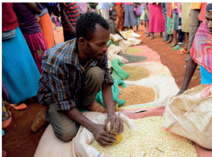
Ethiopia: Men often have better access to markets which can widen the income gap between men and women.

Women and men often have different preferences for income expenditure. As principal caregivers, women prefer to spend their income on food, health and clothing, whereas men prefer to spend their income on production, household maintenance and their personal use. A woman's lack of bargaining power within the household means that even when she earns her own income from the sale of agricultural products, she cannot always decide on how this income is spent.