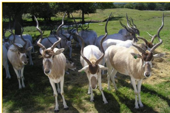
Part of Fossil Rim's valuable collections of dama gazelle, addax (top) and scimitar-horned (side)