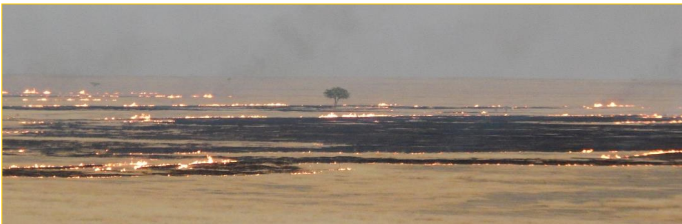
Bushfire in the Ouadi Rimé-Ouadi Achim Game Reserve