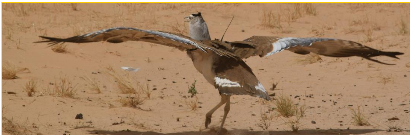
Arabian Bustard Ardeotis arabs fitted with a GPS satellite transmitter