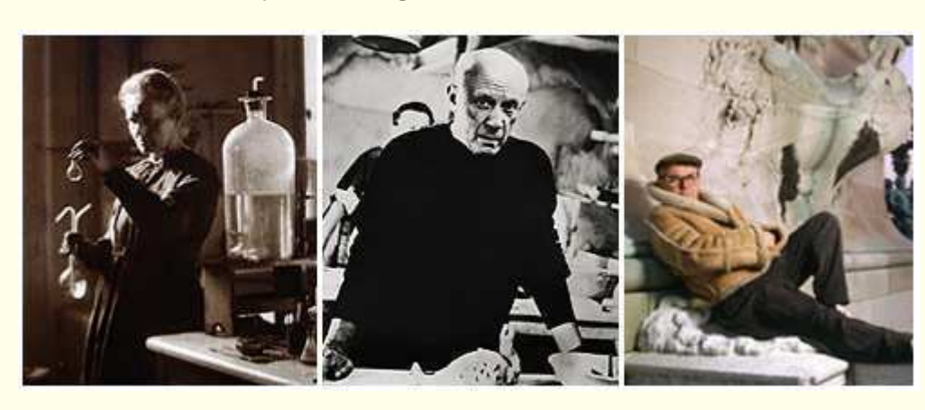
Tim Berners-Lee U2

We have left a blank space on page 29 for your own personal choice. It could be someone famous from your own country, or your favourite European sports team or pop group. Why not find a picture of them and stick it into the blank space, along with a few facts about them.