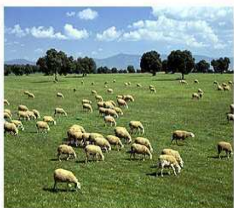
Sheep grazing on grasslands in Spain

Grass grows easily where there is enough rain, even if the soil is shallow or not very fertile. Many European farmers keep animals that eat grass – such as cows, sheep or goats. They provide milk, meat and other useful products like wool and leather.