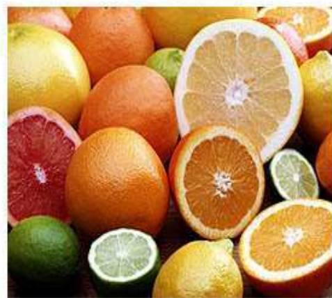
Oranges are grown in warm countries like Spain and are good for our health as they are full of vitamin c

Further south, most of the land is suitable for farming. It produces a wide variety of crops including wheat, maize, sugar beet, potatoes and all sorts of fruit and vegetables.