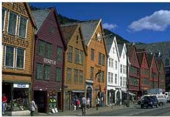
Wooden houses in Bergen, Norway

On high mountains and in the far north of Europe, farming is impossible because it is too cold for crops to grow. But evergreen trees such as pines and firs can survive cold winters. That is why Europe's coldest places are covered with evergreen forests.