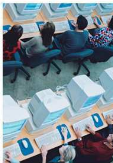
Training people to do new job is very important

It's important for people to have jobs that they enjoy and are good at. Some of the money they earn goes to pay for hospitals and schools, and to look after old people. That's why the EU is doing all it can to create new and better jobs for everyone who can work. It helps people to set up new businesses, and provides money to train people to do new kinds of work.