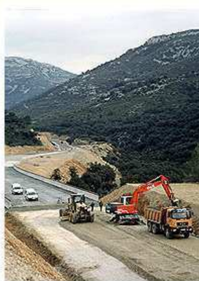
The EU helps pay for new roads

The EU tackles these problems by collecting money from all its member countries and using it to help regions that are in difficulty. For example, it helps pay for new roads and rail links, and it helps businesses to provide new jobs for people.