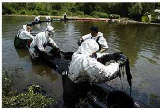
Pollution crosses borders, so EU countries work together to protect the environment

The environment belongs to everyone, so countries have to work together to protect it. The EU has rules about stopping pollution and about protecting (for example) wild birds. These rules apply in all EU countries and their governments have to make sure those rules are obeyed.