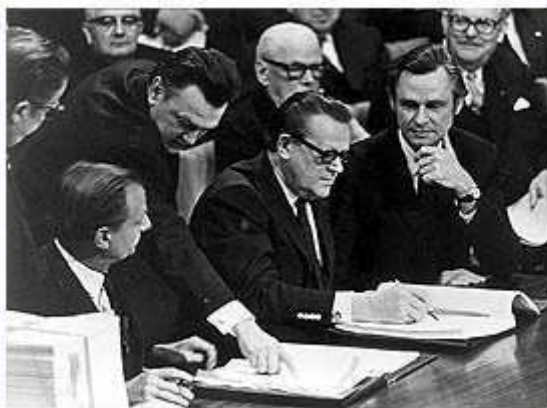
Joining the club. In this picture, Denmark signs up for membership

The common market was soon making life easier for people in the EEC. They had more money to spend, more food to eat and more varied things in their shops. Other neighbouring countries saw this and, in the 1960s, some of them began asking whether they too could join the club.