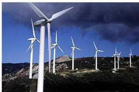
Protecting the environment includes reducing air pollution - for example, using wind energy to make electricity

For example, EEC countries were working together to protect the environment and to build better roads and railways right across Europe. Richer countries helped poorer ones with their road-building and other important projects.